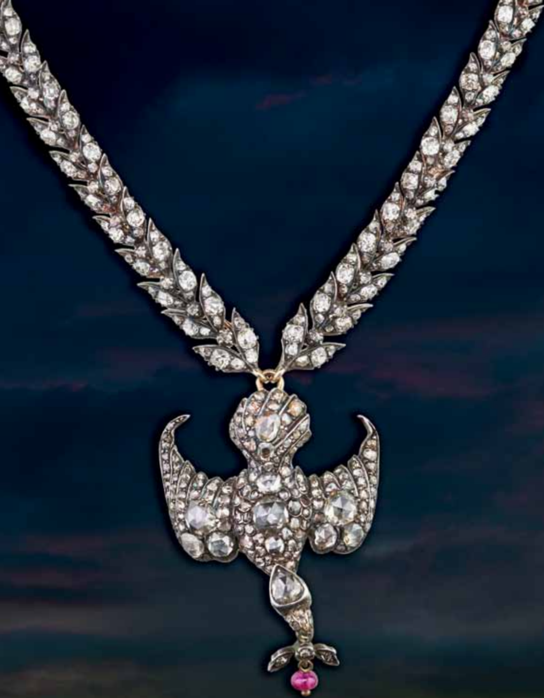
OPPOSITE PAGE 8. Georgian diamond and ruby "Saint Esprit" pendant brooch, on a Georgian graduated diamond leaf neckchain