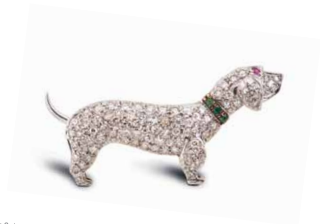
OPPOSITE PAGE 47. Edwardian emerald and old mine-cut diamond hexagonal pendant