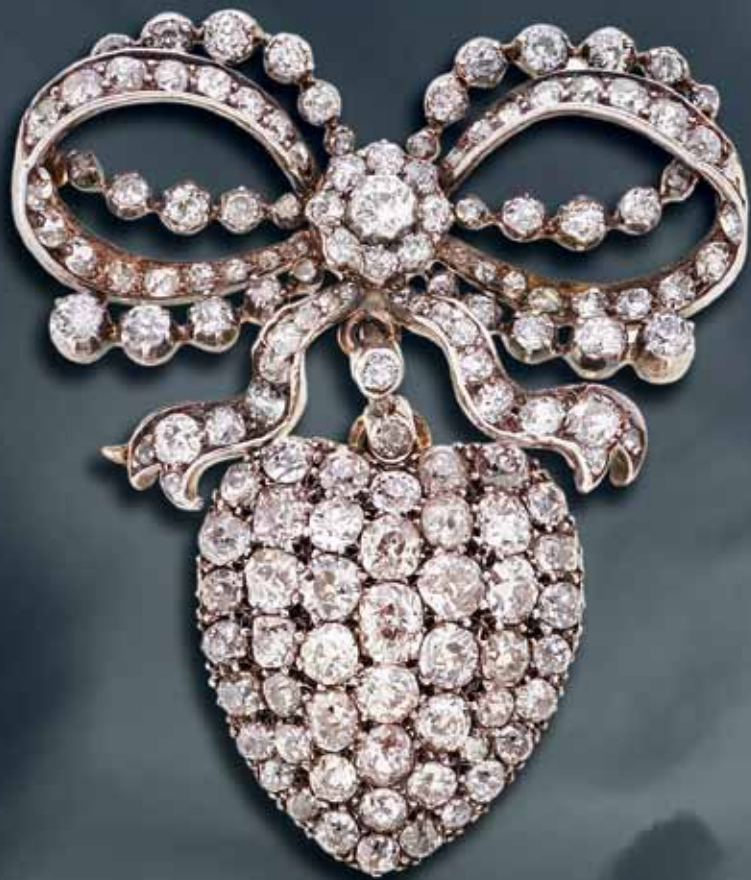
OPPOSITE PAGE 16. Antique diamond ribbon bow brooch suspending a heart-shaped locket pavé-set with old mine-cut diamonds, mounted in silver and gold