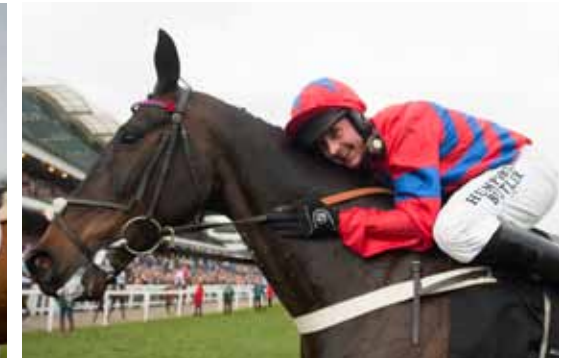
Sponsored by Humphrey Butler Ltd