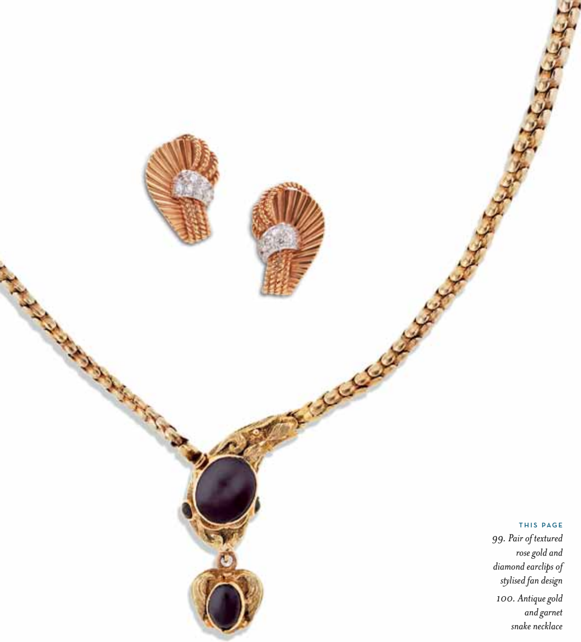
THIS PAGE 99. Pair of textured rose gold and diamond earclips of stylised fan design 100. Antique gold and garnet snake necklace