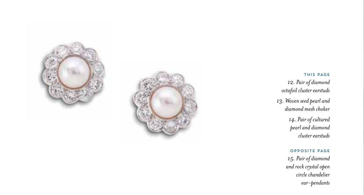
THIS PAGE 12. Pair of diamond octafoil cluster earstuds 13. Woven seed pearl and diamond mesh choker 14. Pair of cultured pearl and diamond cluster earstuds