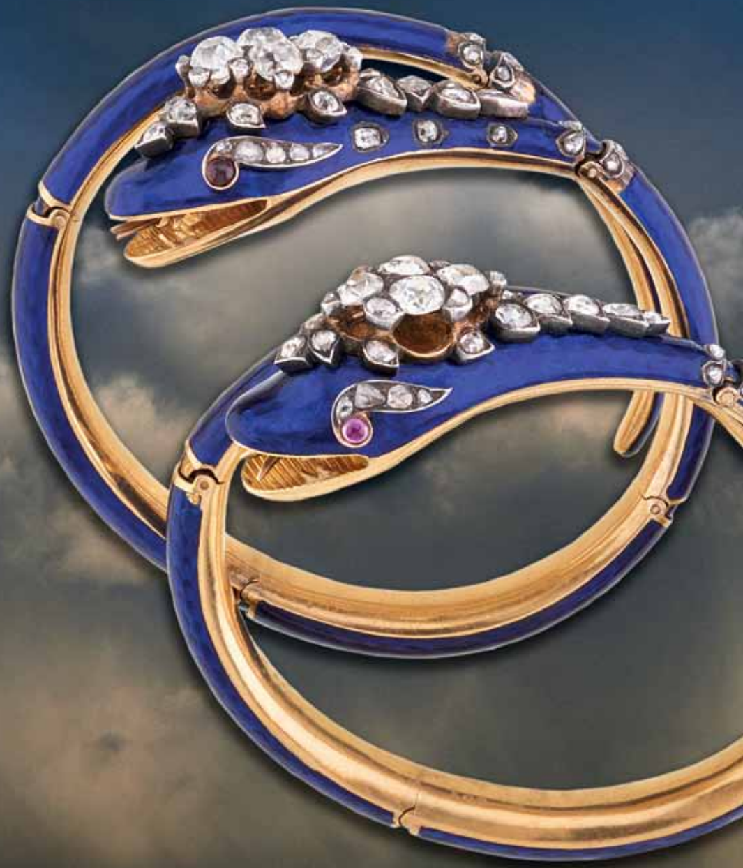
OPPOSITE PAGE 113. Pair of antique blue enamel, ruby and diamond hinged snake bangles