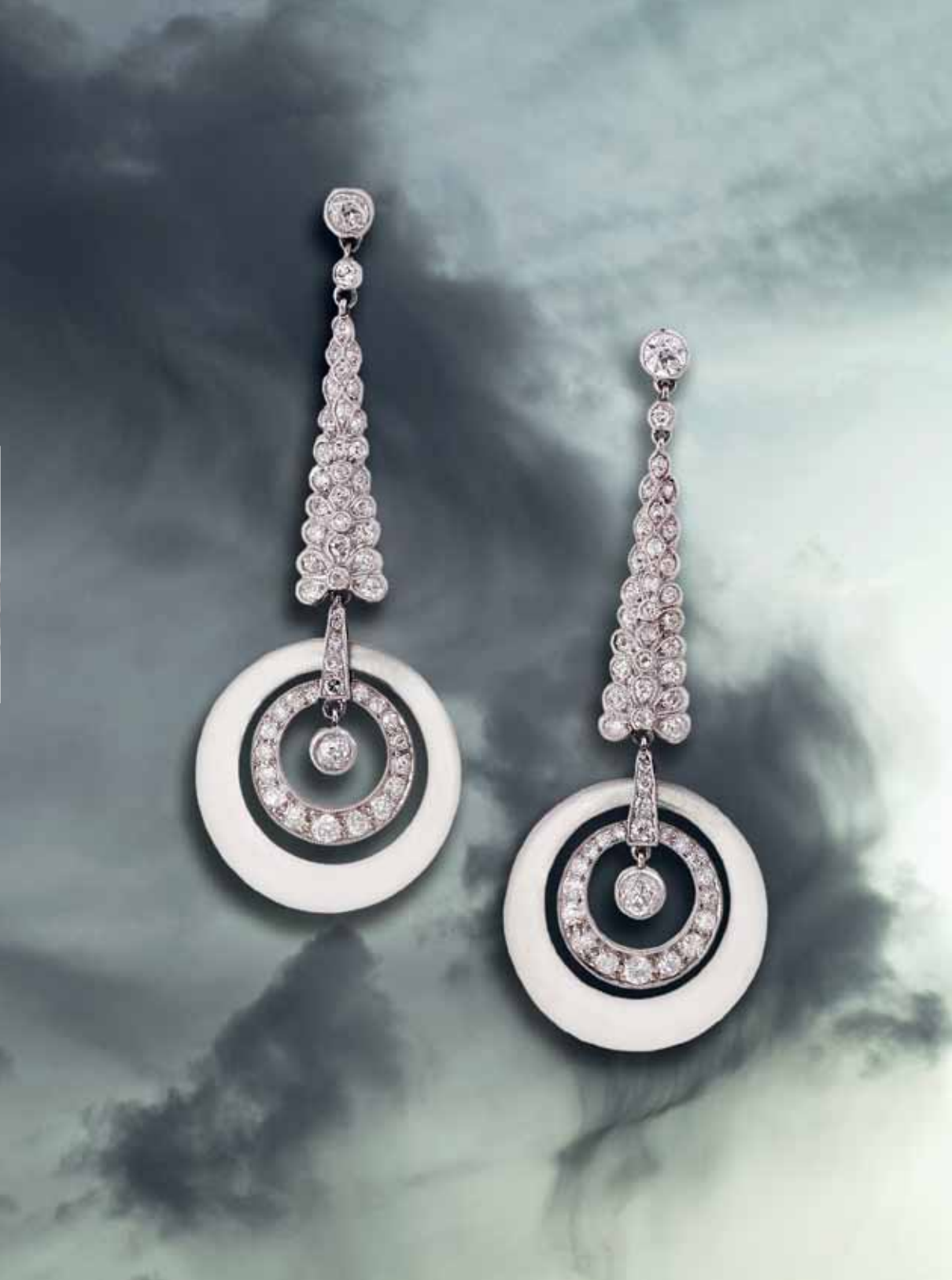
OPPOSITE PAGE 15. Pair of diamond and rock crystal open circle chandelier ear-pendants