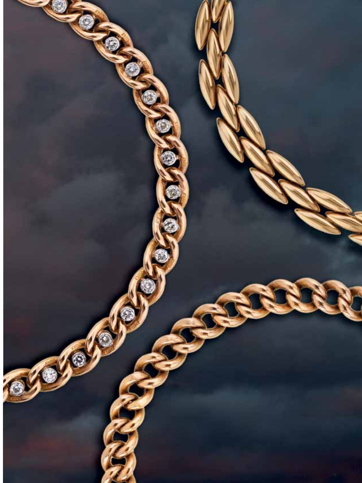
103. Antique 18ct gold curb link bracelet