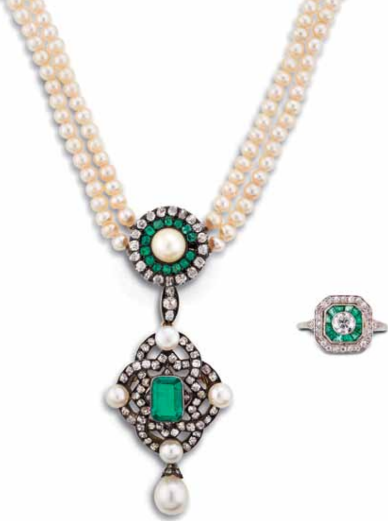
THIS PAGE 44. Antique emerald, pearl and diamond double cluster pendant on a pearl two-row necklace