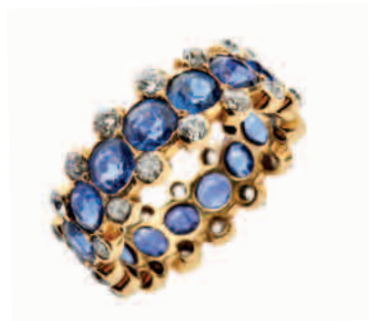
THIS PAGE 122. Cushion-shaped sapphire and diamond full eternity ring, mounted in all gold OPPOSITE PAGE 123. 18ct gold fish scale ribbon bracelet with wirework detail

“Jewellery is not made to give women an aura of wealth, but to make them beautiful.” Coco Chanel