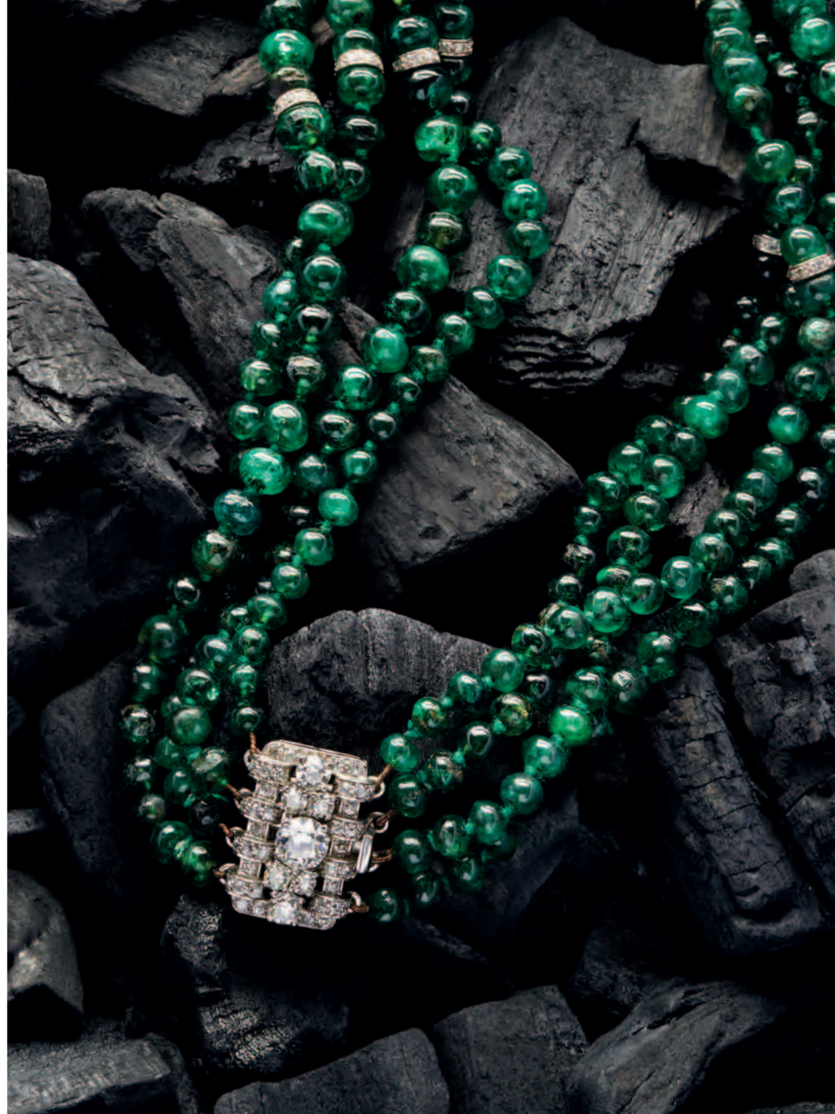
OPPOSITE PAGE 28. Art Deco graduated emerald bead four-row necklace with diamond rectangular panel clasp, mounted by Cartier