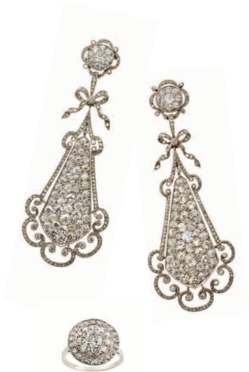
THIS PAGE 12. Pair of Belle Époque diamond kite-shaped ear-pendants, mounted in platinum 13. Edwardian diamond target cluster ring, mounted in platinum, French OPPOSITE PAGE 14. Antique diamond oval cluster ring, mounted in silver and gold