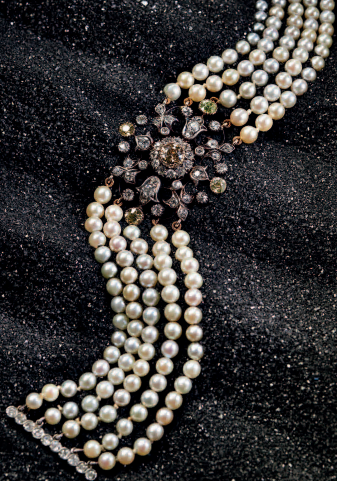
OPPOSITE PAGE 58. Antique cultured pearl and diamond five-row bracelet with pierced cinnamon diamond and diamond circular cluster centre and diamond bar clasp, mounted in silver and gold