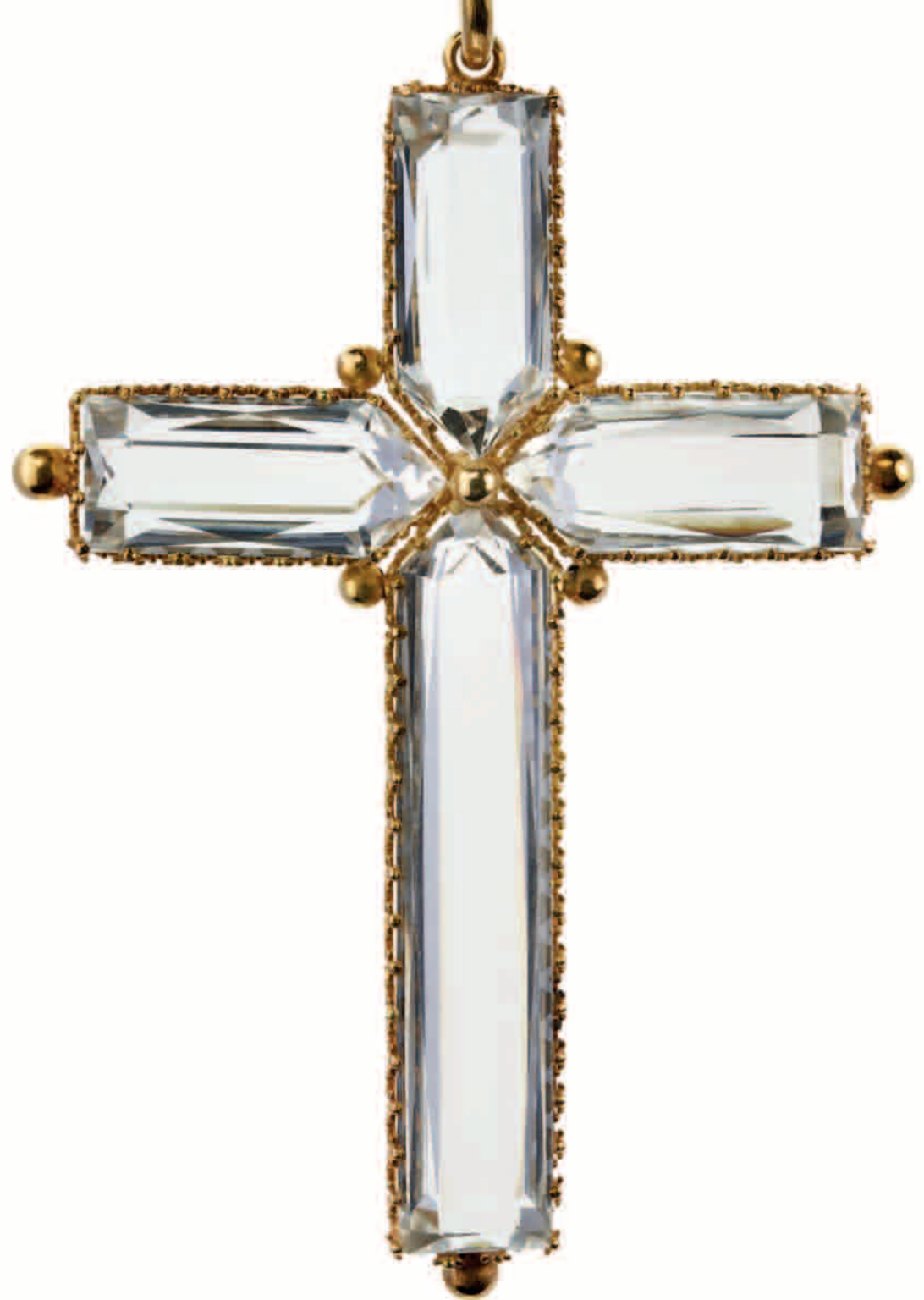
THIS PAGE 124. Antique yellow topaz pendant cross, mounted in all gold 125. Victorian banded agate bead necklace with gold boule spacers suspending a banded agate cross 126. Pair of Art Deco black onyx and rose-cut diamond circular cufflinks OPPOSITE PAGE 127. 19th century gold and rock crystal pendant cross