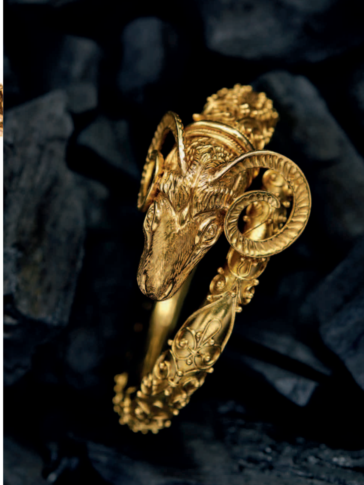
OPPOSITE PAGE 85. 18ct gold ram's head hinged bangle by Lalaounis