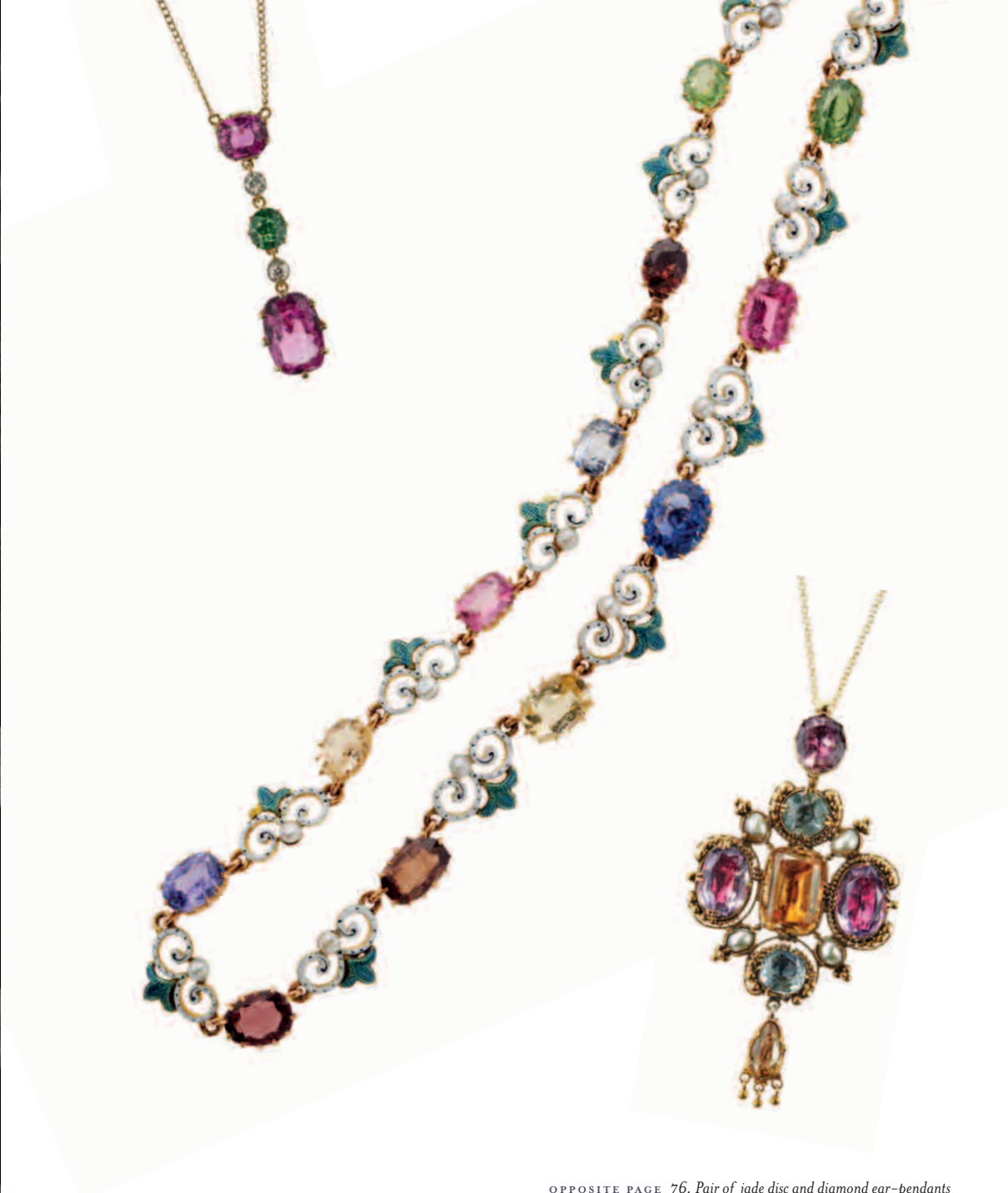
OPPOSITE PAGE 76. Pair of jade disc and diamond ear-pendants