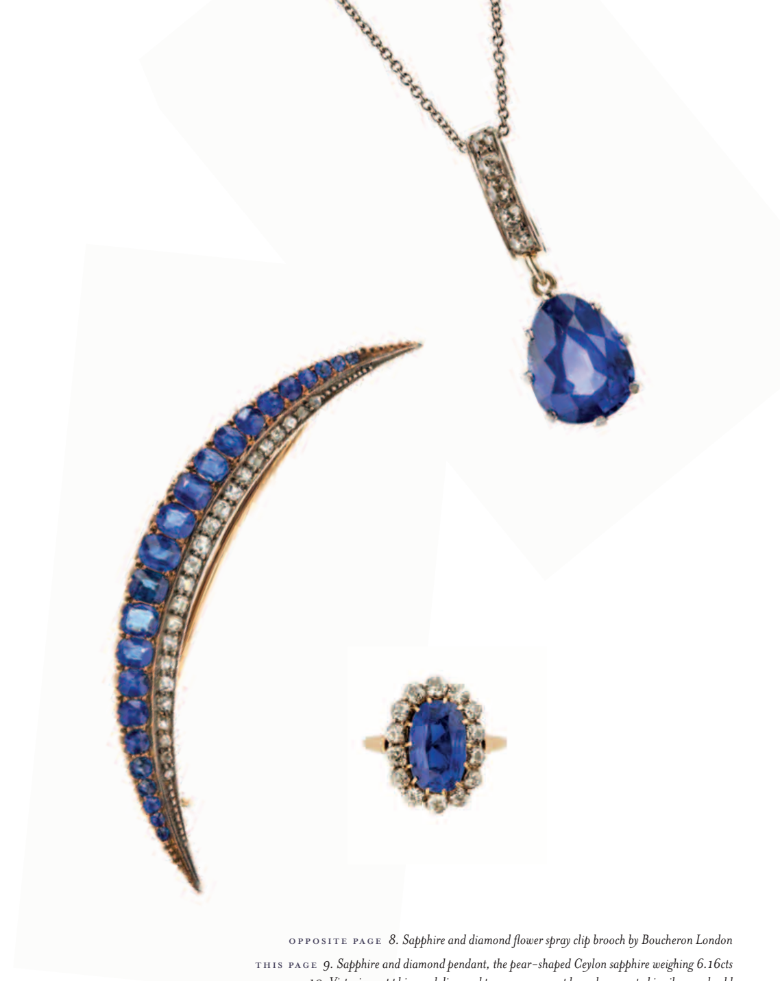
OPPOSITE PAGE 8. Sapphire and diamond flower spray clip brooch by Boucheron London THIS PAGE 9. Sapphire and diamond pendant, the pear-shaped Ceylon sapphire weighing 6.16cts 10. Victorian sapphire and diamond two-row crescent brooch, mounted in silver and gold 11. Victorian sapphire and diamond cluster ring, the oval Ceylon sapphire weighing 7.96cts in an old mine-cut diamond surround