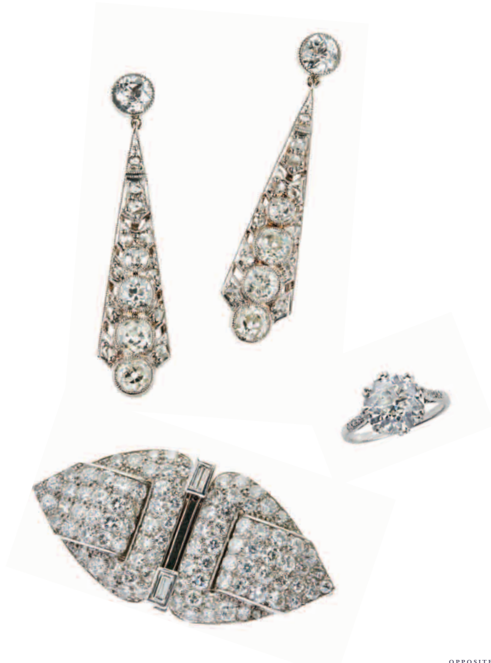
OPPOSITE PAGE 21. Pair of Art Deco diamond ribbon and scroll earclips by Cartier Paris, with adaptable brooch clip fittings