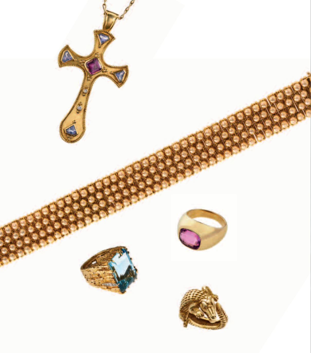
THIS PAGE 80. 18ct gold and gem-set pendant cross by Theo Fennell