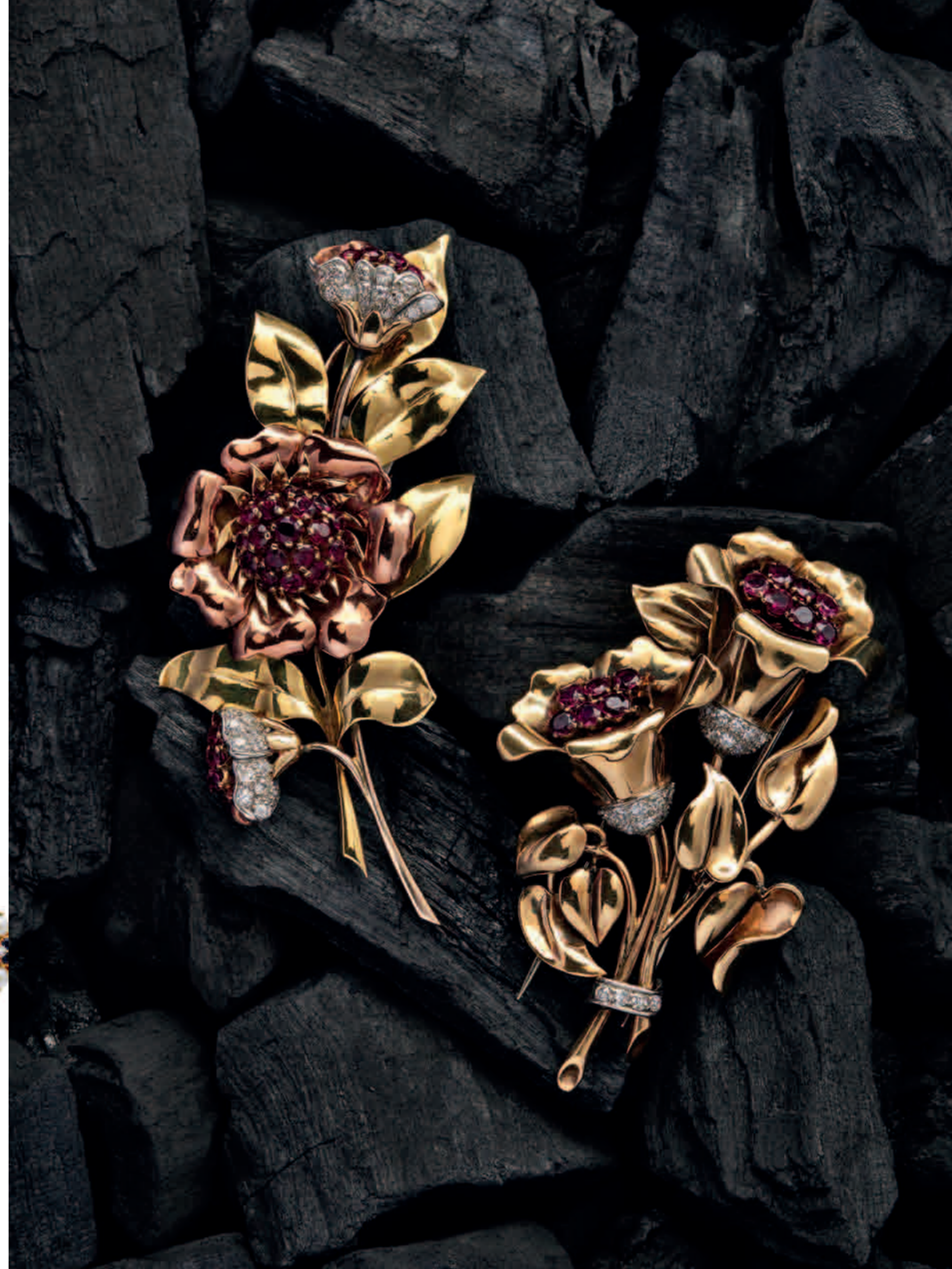
OPPOSITE PAGE 129 (part 2). Two-coloured gold, ruby and diamond flower and leaf spray brooch by Garrard en suite with the earrings 131. Retro gold, ruby and diamond flowerhead spray brooch