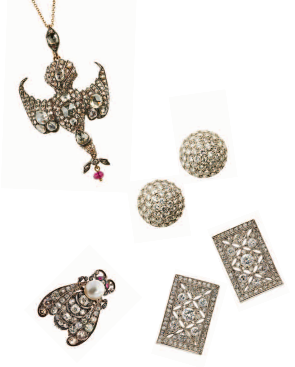
THIS PAGE 71. Georgian rose-cut diamond and ruby "Saint Esprit" pendant brooch 72. Pair of pavé-set brilliant-cut diamond boule earrings 73. Antique pearl and diamond bee brooch with ruby eyes 74. Pair of Art Deco diamond pierced rectangular panel clip brooches OPPOSITE PAGE 75. Pair of old mine-cut diamond Bird of Paradise brooches with cabochon ruby eyes