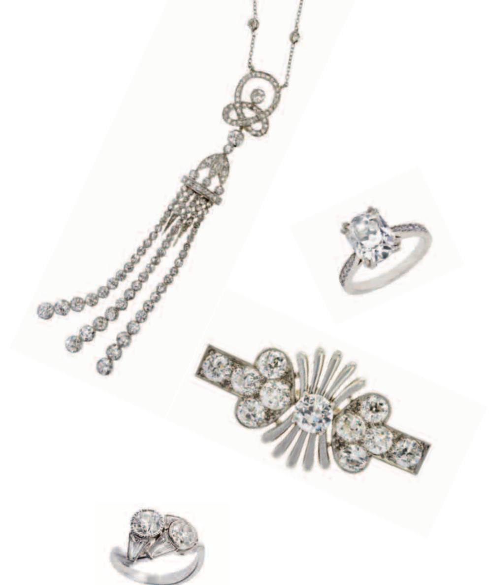
OPPOSITE PAGE 29. Exquisite diamond single-stone ring by Chaumet, the oval cushion-shaped diamond weighing 5.47cts E colour, VVS2 clarity, with diamond shoulders to the platinum hoop