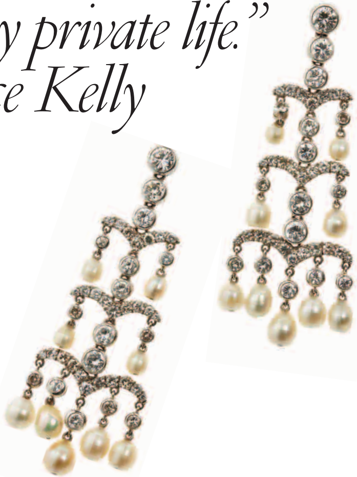
THIS PAGE 57. Pair of diamond and natural pearl cascade earrings

“I favour pearls both on screen and in my private life.” Grace Kelly