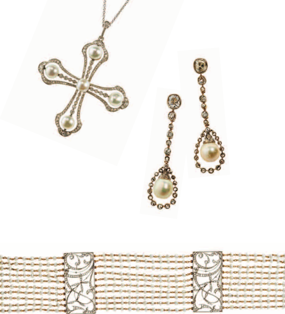
THIS PAGE 64. Edwardian natural pearl and diamond pendant cross