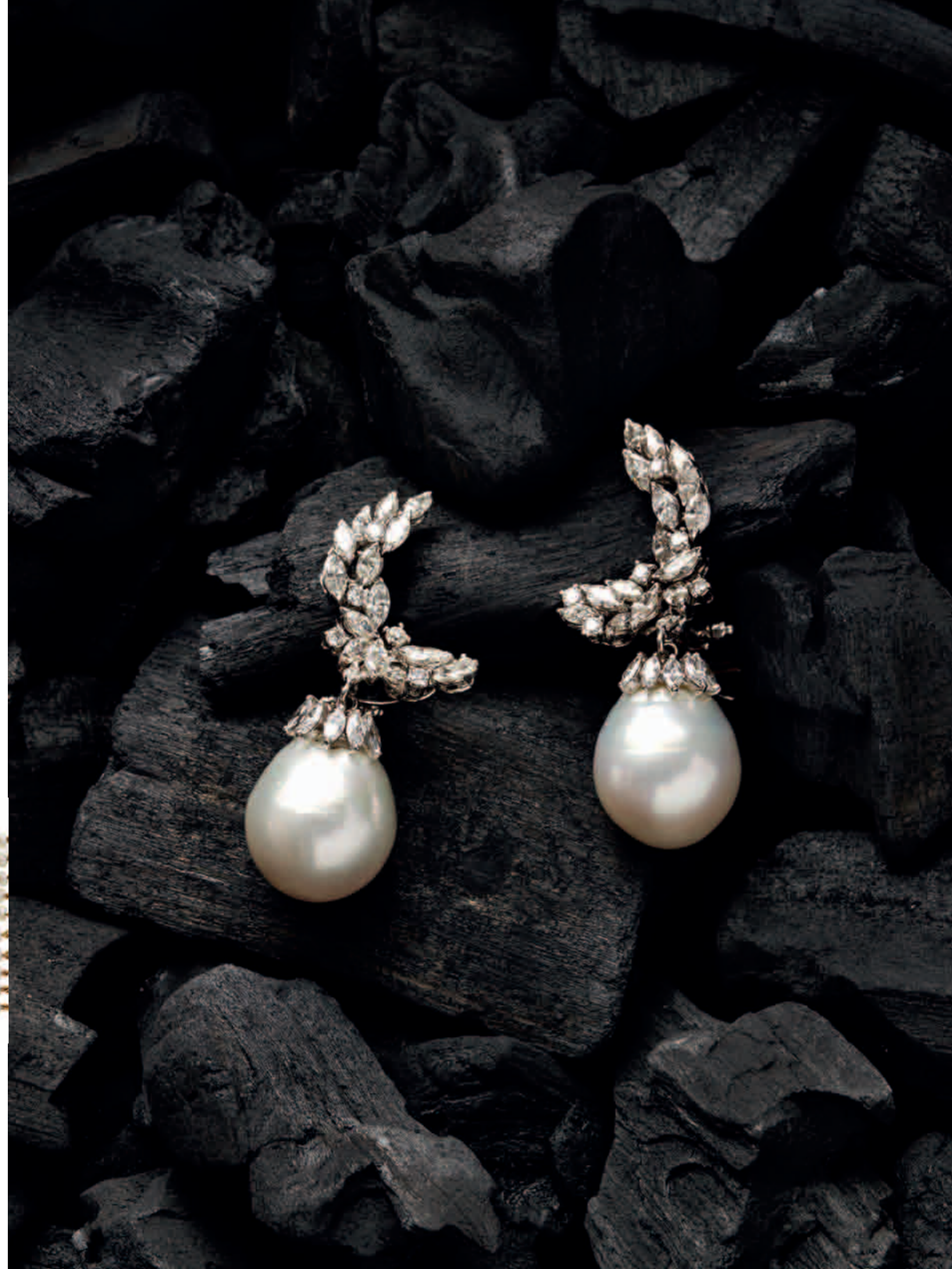
OPPOSITE PAGE 67. Pair of South Sea pearl and brilliant and navette-cut diamond ear-pendants