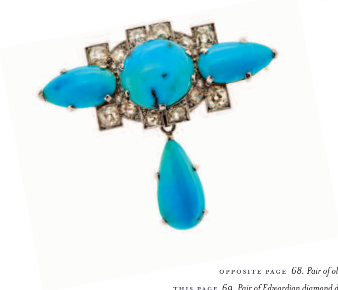
OPPOSITE PAGE 68. Pair of old mine-cut diamond leaf and tassel ear-pendants THIS PAGE 69. Pair of Edwardian diamond drop ear-pendants, mounted in platinum and gold 70. Art Deco turquoise and diamond brooch