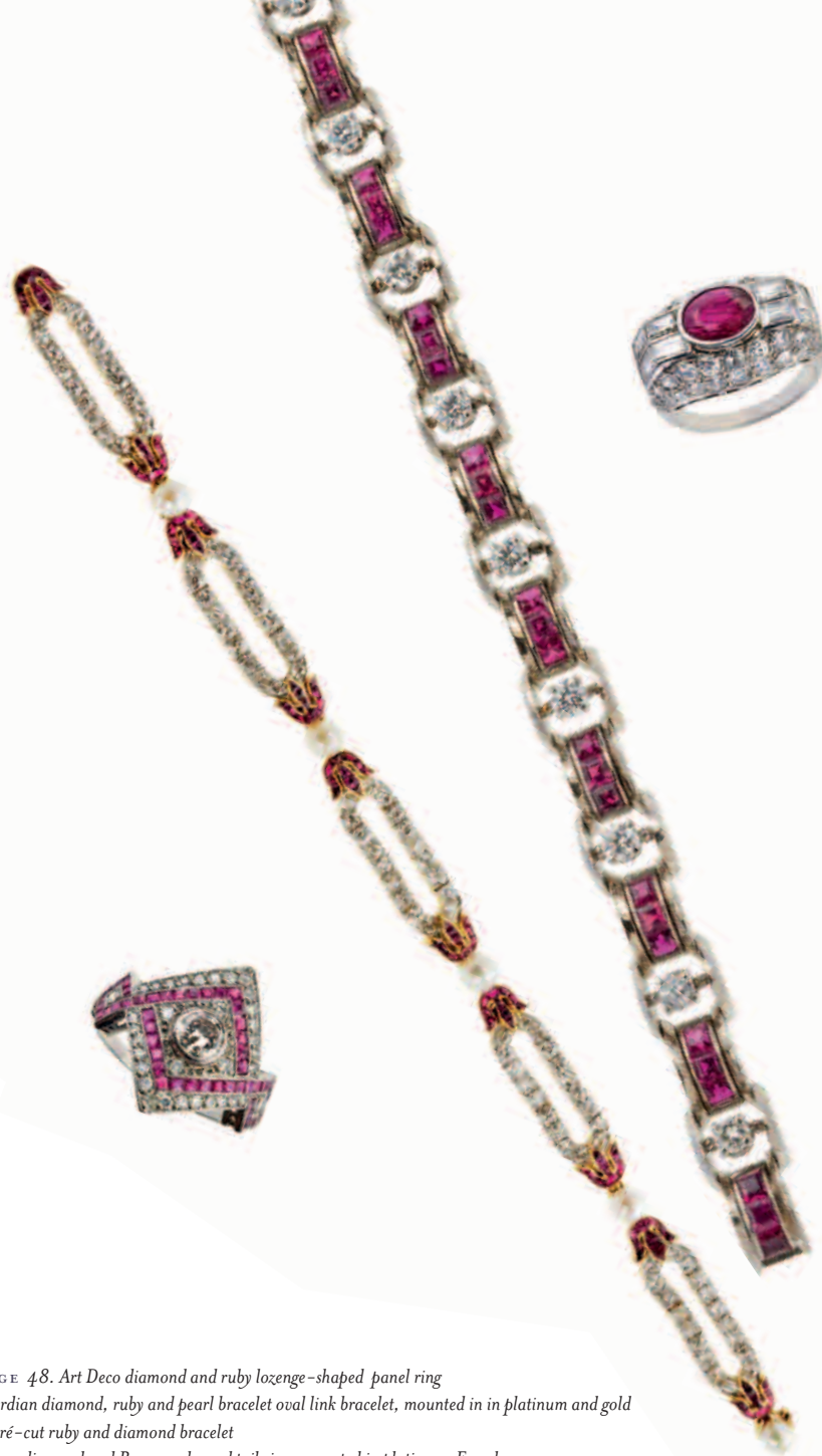
THIS PAGE 48. Art Deco diamond and ruby lozenge-shaped panel ring 49. Edwardian diamond, ruby and pearl bracelet oval link bracelet, mounted in platinum and gold 50. Calibré-cut ruby and diamond bracelet 51. Art Deco diamond and Burma ruby cocktail ring, mounted in platinum, French OPPOSITE PAGE 52. Pair of Art Deco pear-shaped ruby and diamond chandelier ear-pendants