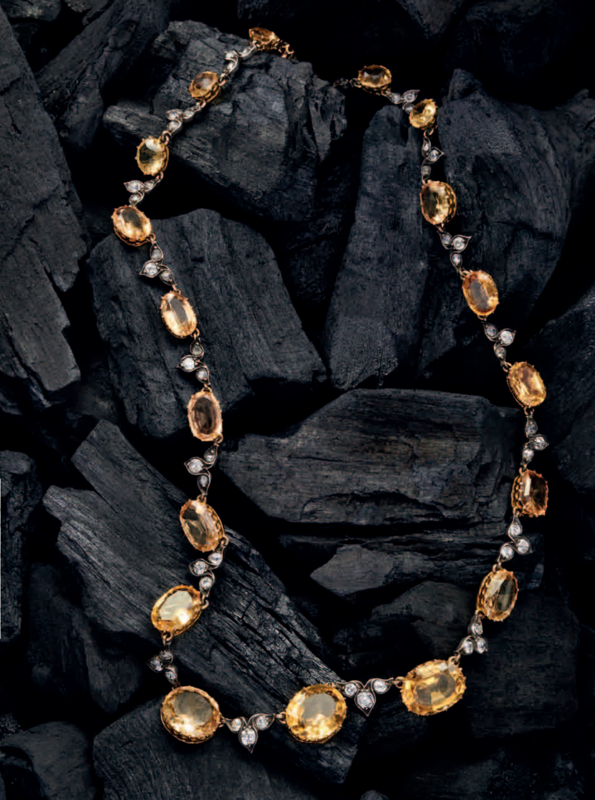
OPPOSITE PAGE 97. Antique graduated cushion-shaped topaz and diamond trefoil necklace