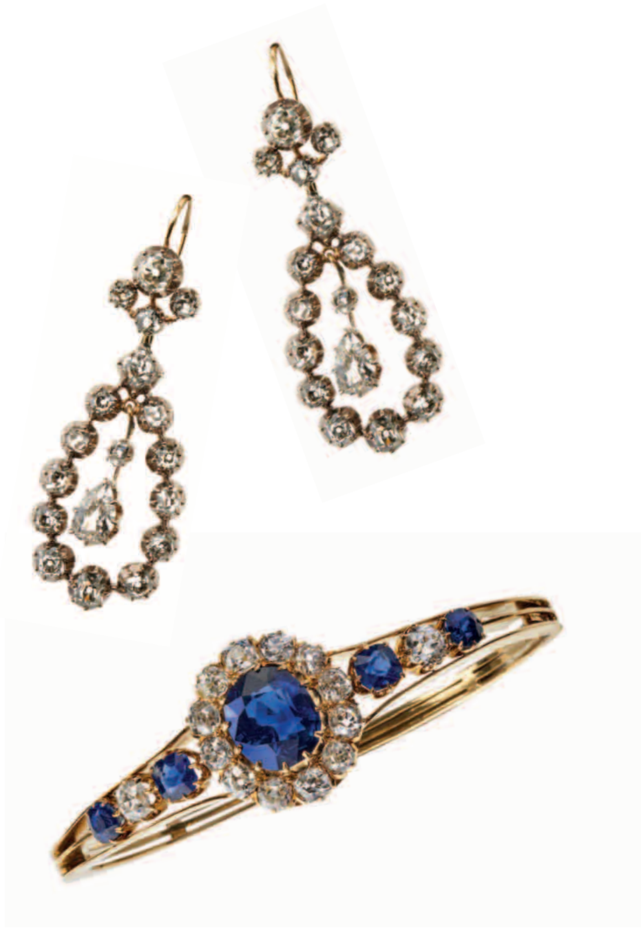
THIS PAGE 34. Pair of antique diamond openwork drop ear-pendants, mounted in silver and gold 35. Victorian sapphire and diamond oval cluster bangle, the sapphire weighing 5.32cts in an old mine-cut diamond surround OPPOSITE PAGE 36. Victorian ruby and diamond cluster ring, the Burma ruby weighing 1.20cts, mounted in silver and gold