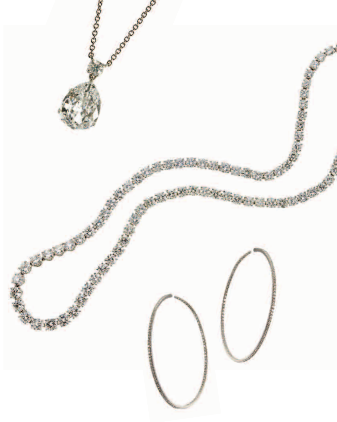
OPPOSITE PAGE 44. Pair of antique old mine-cut diamond rose spray brooches, mounted in silver and gold THIS PAGE 45. Pear-shaped diamond single-stone pendant, the diamond weighing 2.46cts, D colour, Internally Flawless 46. Brilliant-cut diamond rivière by Harry Winston, mounted in white gold 47. Pair of micro-set diamond gypsy hoop earrings, mounted in 18ct white gold