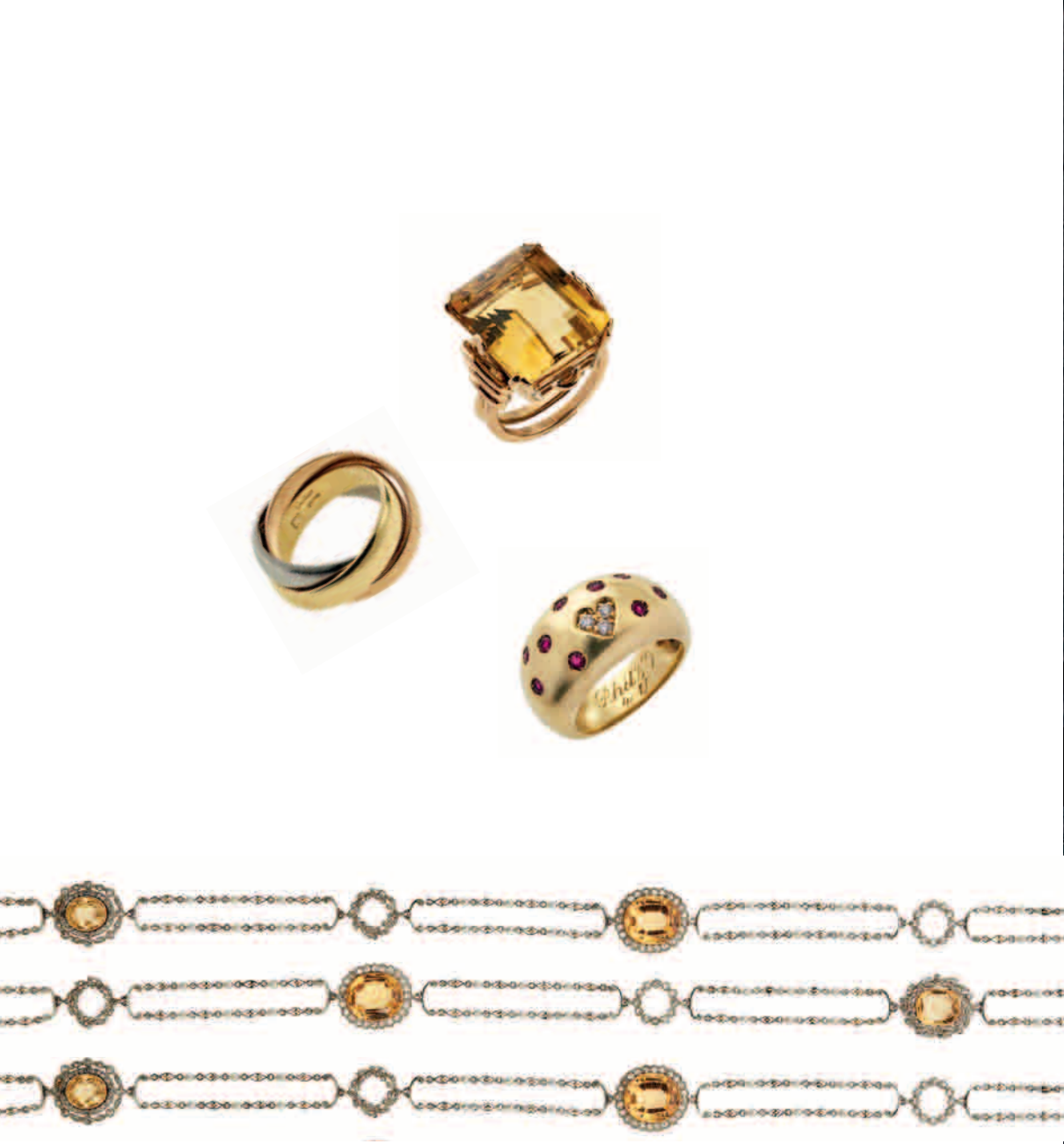
THIS PAGE 93. Rectangular-cut citrine cocktail ring on a gold wirework mount 94. 1.8ct three-coloured gold trinity ring by Cartier 95. Ruby, diamond and gold gypsy ring, by Faraone 96. Belle Epoque topaz and rose-cut diamond cluster sautoir