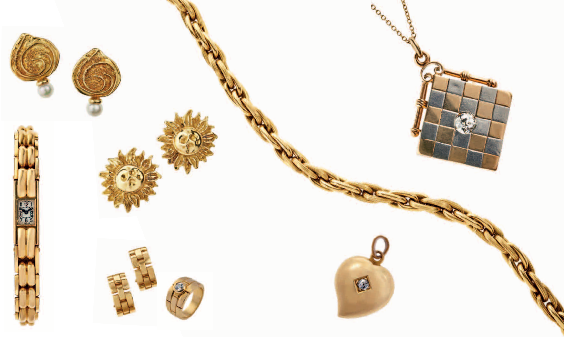
THIS PAGE 86. Pair of yellow gold and cultured pearl Shiraz earclips by Elizabeth Gage 87. Pair of yellow gold sunray earclips by Elizabeth Gage 88. Lady's 18ct gold slim rectangular cocktail watch by Cartier 89. Pair of 18ct yellow gold Maillon de Panthere earclips by Cartier with diamond-set ring en suite