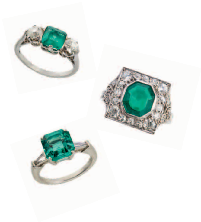
THIS PAGE 25. Rectangular-cut emerald and old mine-cut diamond three-stone ring, mounted in platinum