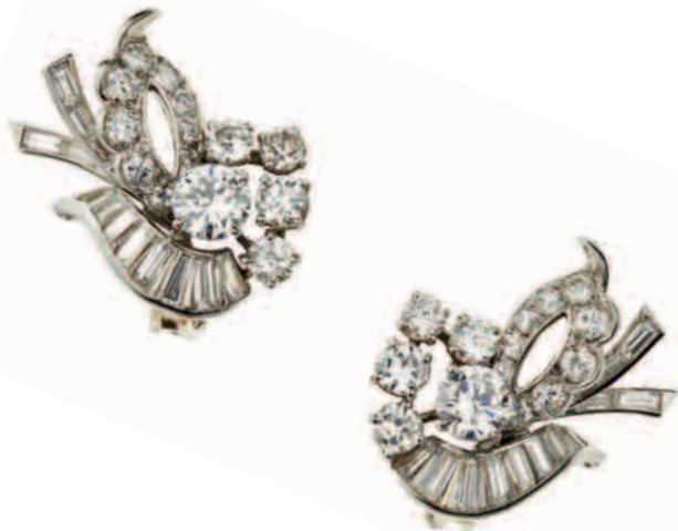
THIS PAGE 42. Pair of brilliant and baguette-cut diamond floral bouquet earclips by Mauboussin, French OPPOSITE PAGE 43. Pair of Art Deco diamond and black onyx chevron leaf and collet ear-pendants

“You can always tell what kind of a person you are by the earrings he gives you.” Audrey Hepburn