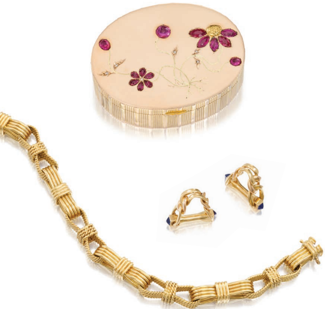
THIS PAGE 86. Ruby and gold oval snuff box by Lacroche, the polished lid applied with a floral pattern 87. Pair of 18ct gold and sugarloaf cabochon sapphire stirrup cufflinks by Cartier 88. 18ct textured gold bow link bracelet by Bulgari OPPOSITE PAGE 89. Art Deco nephrite rectangular card case with diamond-set clasp and hinges 90. Pair of fluted rock crystal and ruby flowerhead cufflinks with diamond centres 91. Pair of Victorian Essex crystal reverse intaglio fighting cock cufflinks, mounted in 18ct gold 92. Pair of platinum and diamond openwork target cluster cufflinks 93. Gold "Atlas" bracelet by Tiffany