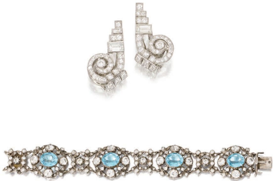
THIS PAGE 51. Pair of brilliant and baguette-cut diamond stylised wing earclips 52. Blue and white paste openwork bracelet, mounted in silver OPPOSITE PAGE 53. Rectangular-cut aquamarine single-stone ring with diamond split shoulders