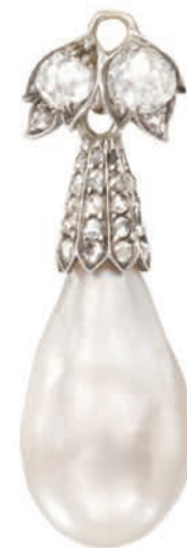
OPPOSITE PAGE 29. Antique diamond, rose-cut diamond and pearl openwork wreath brooch, mounted in silver and gold THIS PAGE 30. Antique natural pearl and diamond drop, the pearl measuring approx 19.00mm in length