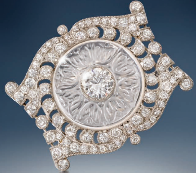
THIS PAGE 19. Belle Epoque diamond line bracelet with circular cluster centre 20. Pair of diamond openwork snowflake cluster earclips mounted in white gold OPPOSITE PAGE 21. Art Deco diamond and carved rock crystal stylised panel brooch by Cartier