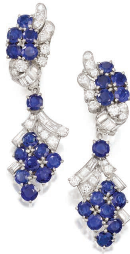
OPPOSITE PAGE 6. Art Deco cabochon sapphire and diamond openwork articulated panel bracelet by Lacloue THIS PAGE 7. Pair of brilliant-cut diamond and circular-cut sapphire vine cluster ear-pendants with baguette-cut diamond detail, by Gazdar