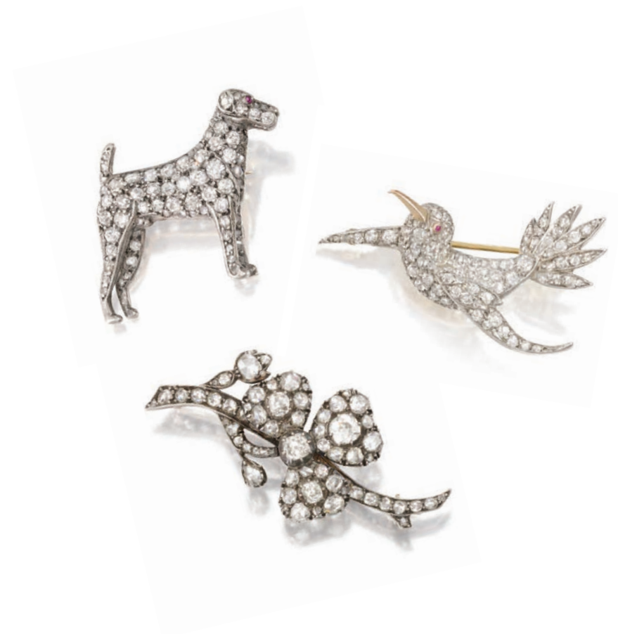
OPPOSITE PAGE 54. Edwardian diamond openwork snowflake brooch pendant, mounted in platinum THIS PAGE 55. Edwardian pavé-set diamond terrier brooch with ruby eye, mounted in silver and gold 56. Antique diamond bird brooch, mounted in silver and gold 57. Antique diamond shamrock brooch, mounted in silver and gold