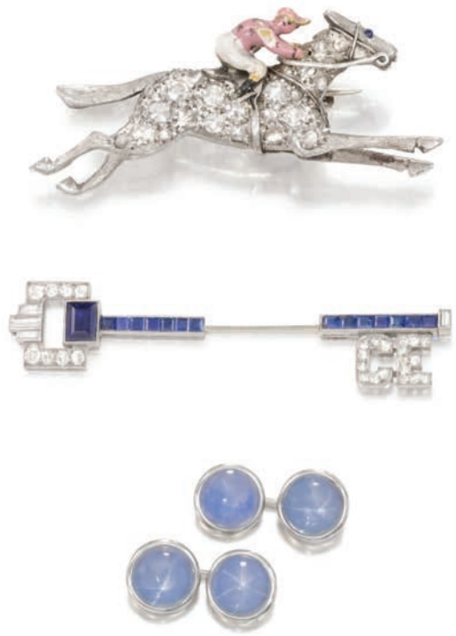
THIS PAGE 58. Enamel and diamond horse and jockey brooch 59. Art Deco sapphire and diamond jabot pin designed as a key 60. Pair of cabochon star sapphire cufflinks, mounted in platinum OPPOSITE PAGE 61. Edwardian amethyst and diamond cluster brooch in the garland style