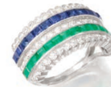
OPPOSITE PAGE 35. Antique emerald and diamond cluster pendant of stylised octafoil design, with brooch and hair comb fitting, mounted in silver and gold THIS PAGE 36. Art Deco cushion-shaped emerald and square-cut diamond half-hoop ring 37. Art Deco diamond and emerald bombé cluster ring, mounted in platinum 38. Calibré-cut sapphire, calibré-cut emerald and single-cut diamond five-row half eternity ring