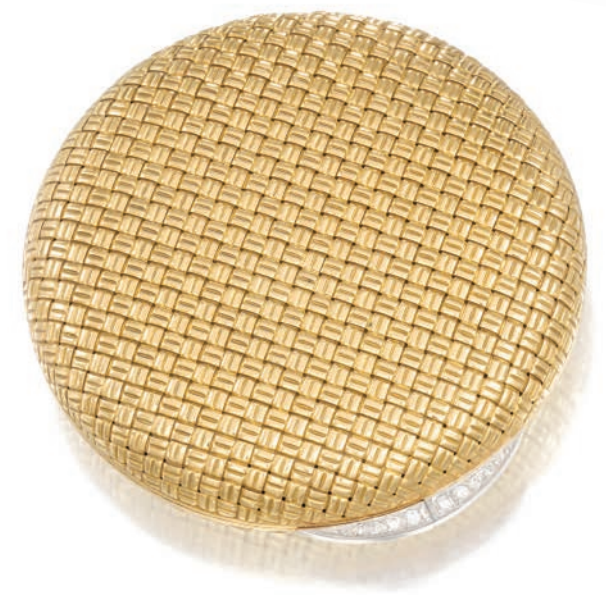
OPPOSITE PAGE 82. Pair of 14ct gold knot cufflinks by Raymond Yard 83. Edwardian 14ct gold, ruby and diamond chain link bracelet, in fitted case THIS PAGE 84. Pair of gold loaf cufflinks of basket-weave design 85. Gold basket-weave circular powder compact by Van Cleef & Arpels