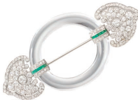
THIS PAGE 39. Art Deco diamond and rock crystal open circle brooch, the diamond palm front terminals each with calibré-cut emerald detail OPPOSITE PAGE 40. Art Deco frosted rock crystal and diamond brooch pendant with triple tassel terminals, signed Cartier Paris, Londres, New York, no. 1493