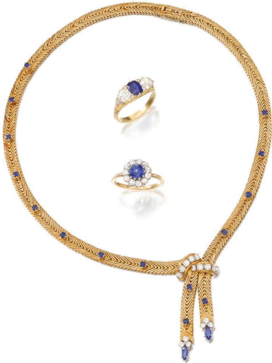
THIS PAGE 65. Gold herringbone, sapphire and diamond ribbon tassel necklace 66. Sapphire and diamond three-stone carved half-hoop ring mounted in gold 67. Sapphire and diamond circular cluster ring, mounted in silver and gold OPPOSITE PAGE 68. Pair of 18ct gold and diamond ribbon spray earclips by Tiffany