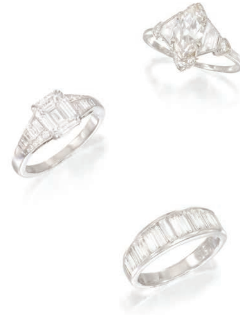
OPPOSITE PAGE 15. Pair of pear-shaped and baguette-cut diamond ear-pendants, each pear-shaped diamond drop weighing approx 3.00cts THIS PAGE 16. Emerald-cut diamond single-stone ring (2.03cts, D colour, VS1 clarity) with brilliant and baguette-cut diamond crossover shoulders 17. Art Deco navette-cut diamond cluster ring, mounted in platinum 18. Baguette-cut diamond half-eternity ring by Oscar Heyman