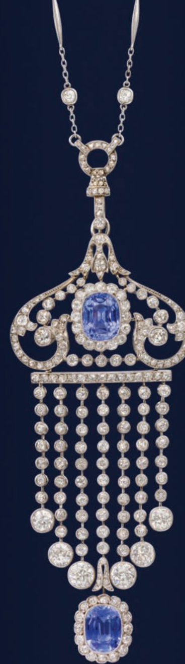
OPPOSITE PAGE 5. Edwardian sapphire and diamond tassel pendant necklace forming brooch