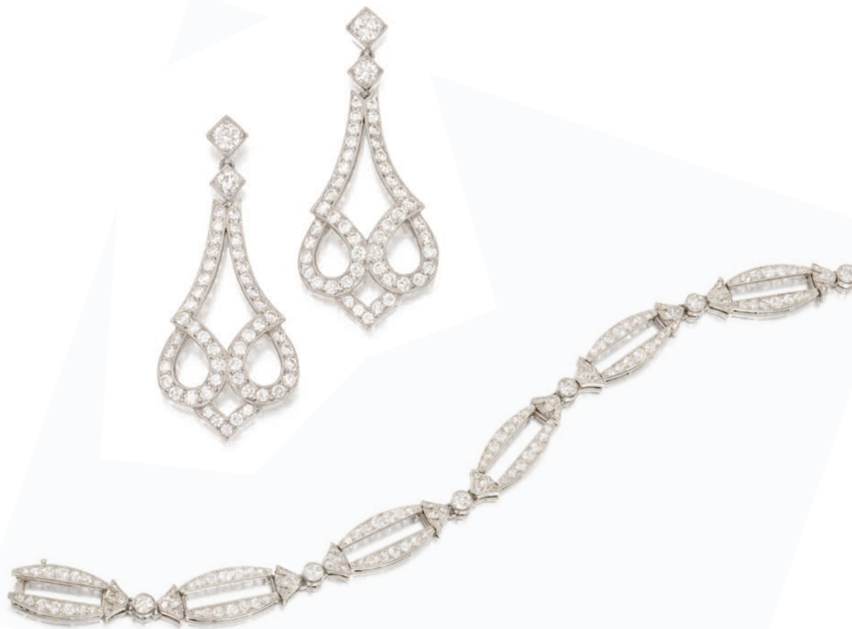
THIS PAGE 8. Pair of diamond open ribbon-work chandelier ear-pendants 9. Belle Epoque diamond and platinum openwork bracelet, French OPPOSITE PAGE 10. Yellow sapphire and marquise-cut diamond cocktail ring mounted in platinum, French