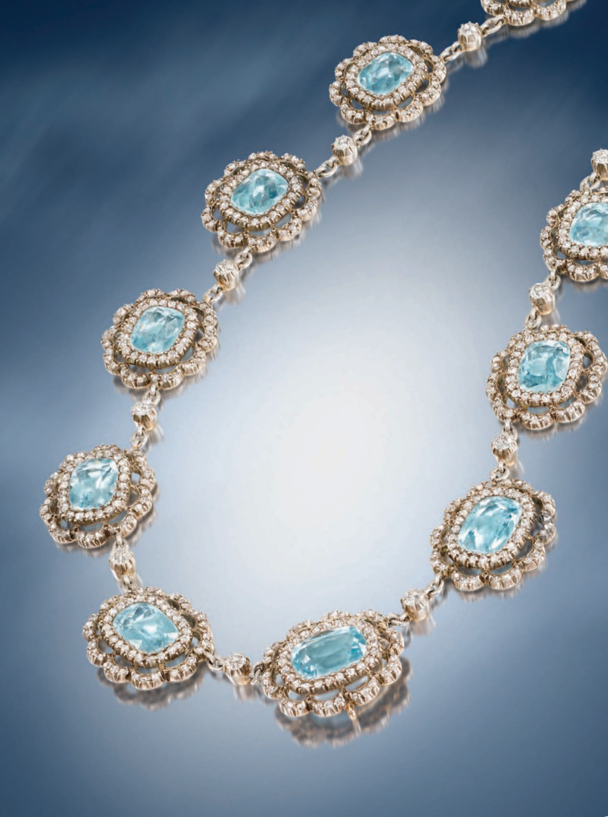
OPPOSITE PAGE 48. Edwardian cushion-shaped aquamarine and diamond cluster necklace in the garland style, mounted in silver and gold, in fitted case by London & Ryder THIS PAGE 49. Pair of briolette-cut aquamarine and diamond chain ear-pendants 50. Pair of pear-shaped aquamarine ear-pendants with diamond ribbon loop and collet mounts