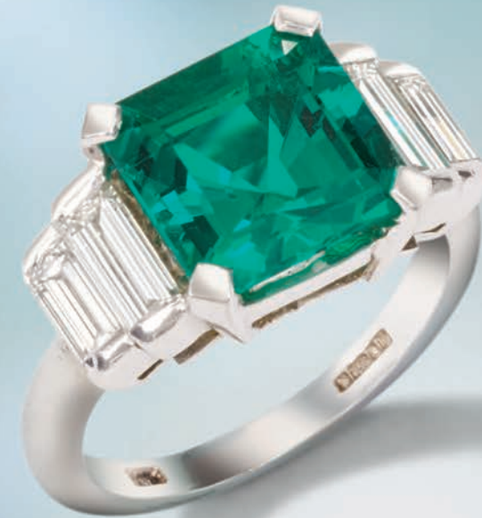
THIS PAGE 31. Emerald and diamond rectangular cluster ring mounted in platinum 32. Victorian demantoid garnet graduated five-stone carved half-hoop ring mounted in gold 33. Important brilliant-cut diamond ring with calibré-cut emerald and diamond florette detail, the central diamond weighing approx. 3.75cts OPPOSITE PAGE 34. Square-cut Colombian emerald ring with baguette-cut diamond shoulders, the emerald weighing 3.10cts