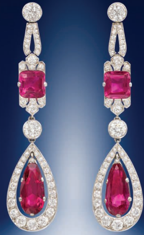
THIS PAGE 25. Antique ruby and diamond circular brooch pendant, mounted in silver and gold, in fitted case 26. Brilliant and baguette-cut diamond cravat necklace with baguette-cut diamond furred crossover to the centre 27. Art Deco ruby and diamond ring of stylised bow tie design OPPOSITE PAGE 28. Pair of exquisite Art Deco Burma ruby and diamond ear-pendants