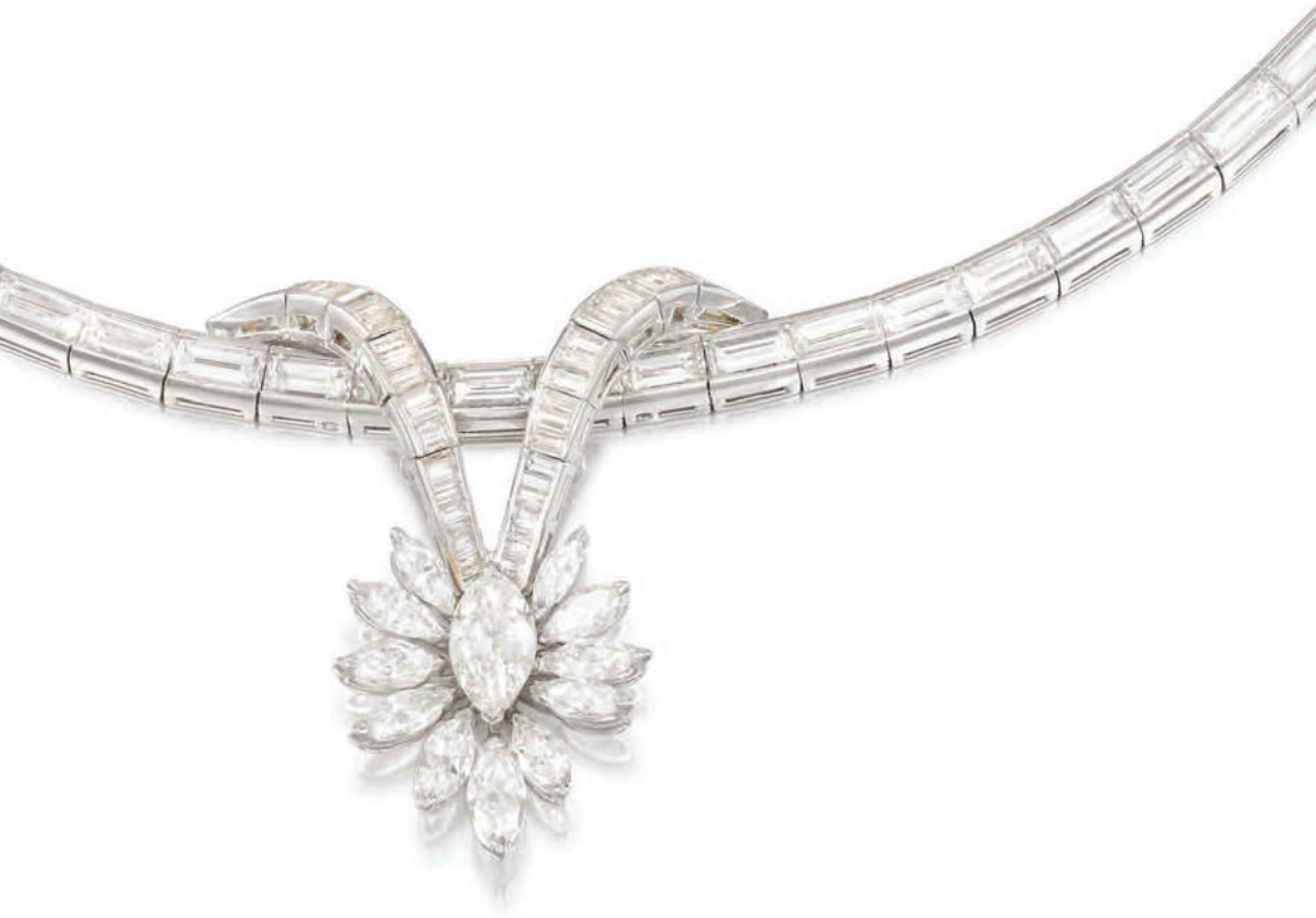
THIS PAGE 13. Baguette-cut diamond line necklace centering on a navette-cut diamond floral cluster OPPOSITE PAGE 14. Pair of late Victorian diamond collet, leaf and ribbon bow openwork ear-pendants, mounted in silver and gold