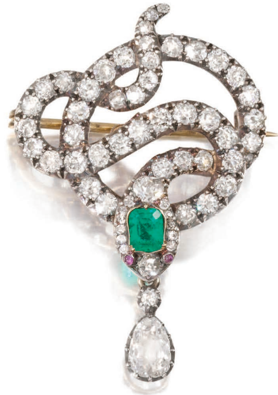
46. Lady's diamond-set cocktail watch by Kelbert OPPOSITE PAGE 47. Antique diamond coiled snake brooch with emerald-set head, mounted in silver and gold, in fitted case