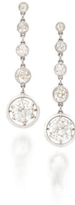
OPPOSITE PAGE 11. Belle Epoque diamond lavalier, suspending two brilliant-cut diamonds weighing approx 4.00cts each THIS PAGE 12. Pair of diamond ear-pendants, each diamond collet chain suspending an old mine-cut diamond weighing 1.26ct and 1.31ct respectively