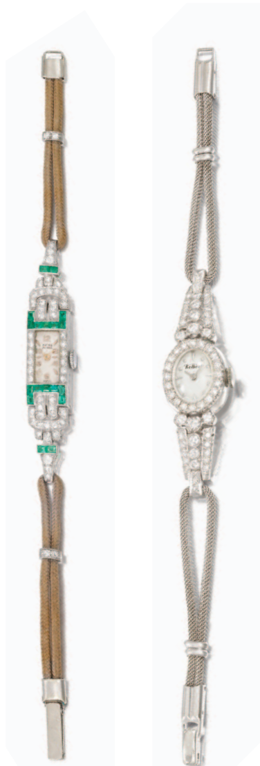
THIS PAGE 45. Lady's Art Deco emerald and diamond cocktail watch