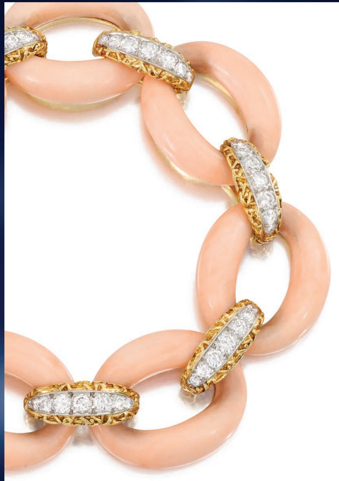
THIS PAGE 72. 18ct yellow gold and pavé-set diamond cocktail ring of toi-et-moi design THIS PAGE AND OPPOSITE PAGE 73. Coral and diamond oval link bracelet mounted in gold, by Van Cleef & Arpels, with a coral, diamond and gold cocktail ring en suite