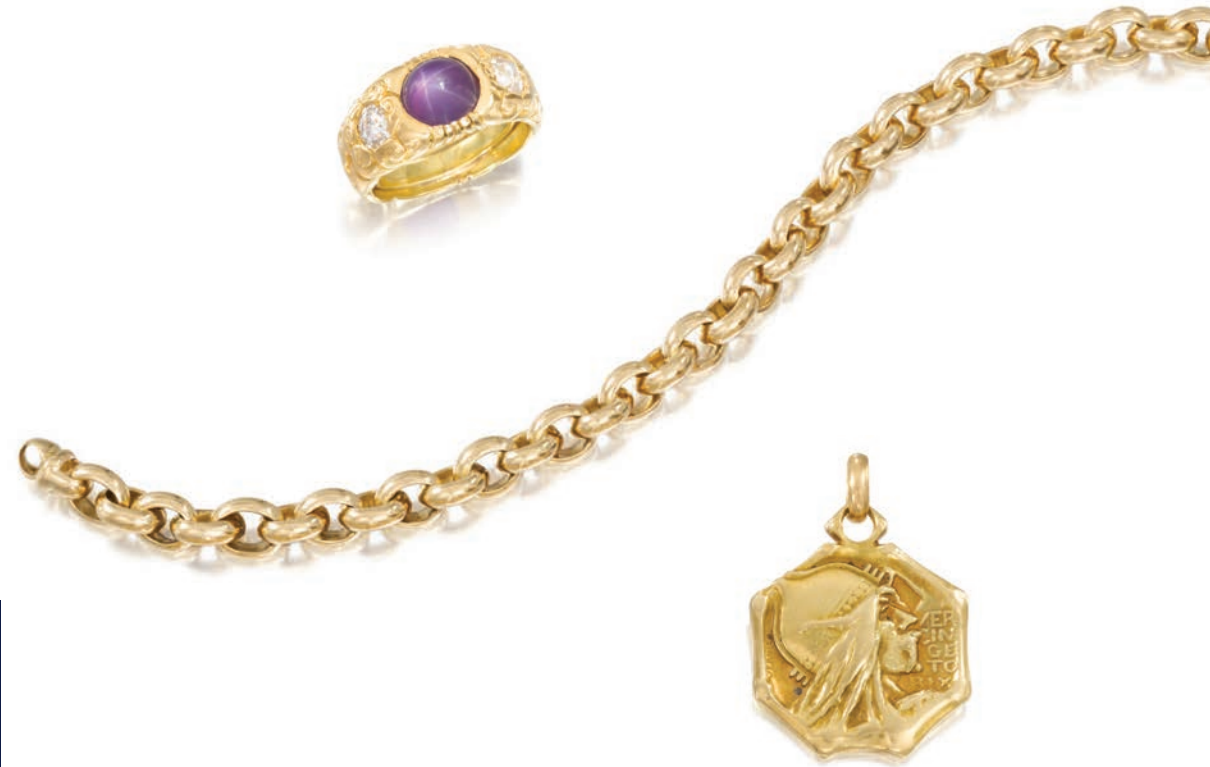
OPPOSITE PAGE 74. Two-coloured gold circular MY LOVE charm THIS PAGE 75. Star ruby and diamond gypsy ring in engraved gold mount by Tiffany 76. 18ct yellow gold chain link bracelet by Van Cleef & Arpels 77. Yellow gold octagonal medallion pendant depicting the helmeted head of Vercingetorix, with Veleda on the reverse, French