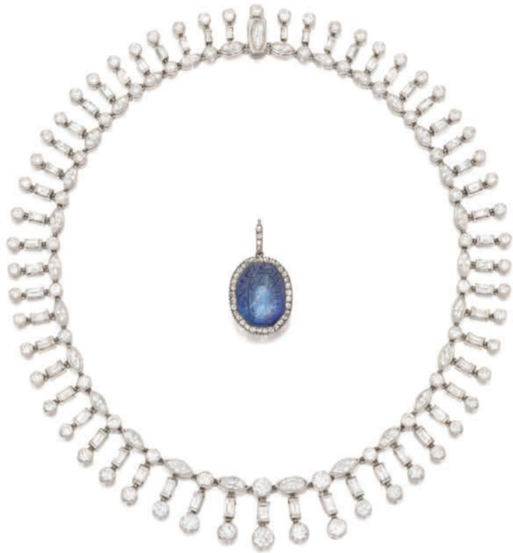
THIS PAGE 3. Antique engraved sapphire and rose-cut diamond oval pendant

Jewellery takes people's minds off your wrinkles. Sonja Henie