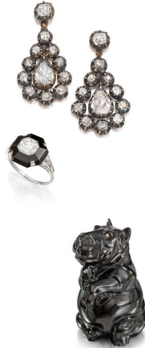
OPPOSITE PAGE 41. Lady's Art Deco diamond and black onyx cocktail watch by Cartier, with rose-cut diamond deployant buckle, mounted in gold THIS PAGE 42. Pair of antique diamond tear-drop cluster earrings, mounted in silver and gold 43. Art Deco black onyx and diamond panel ring, French 44. Carved hardstone figure of a seated hippopotamus