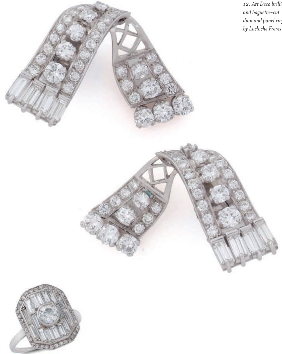
THIS PAGE 11. Pair of Art Deco brilliant and baguette-cut diamond sprung earclips of openwork ribbon design