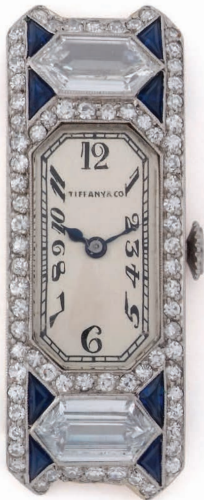
OPPOSITE 13. Art Deco sapphire and diamond cocktail watch, by Tiffany