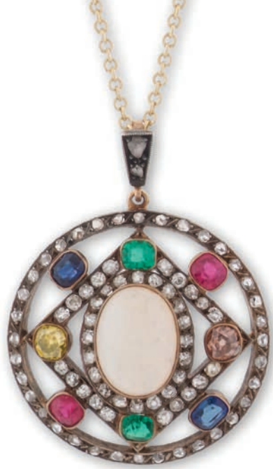
ABOVE 67. Antique diamond and multi-gem pendant of open circle and lozenge design, mounted in silver and gold