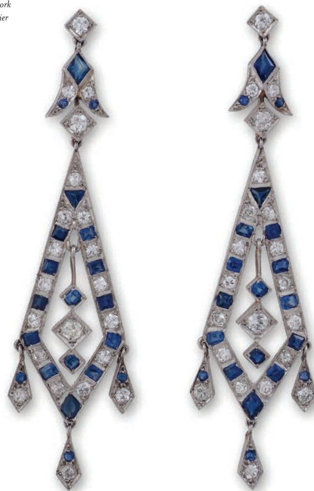
THIS PAGE 14. Pair of sapphire and diamond openwork kite-shaped chandelier ear-pendants