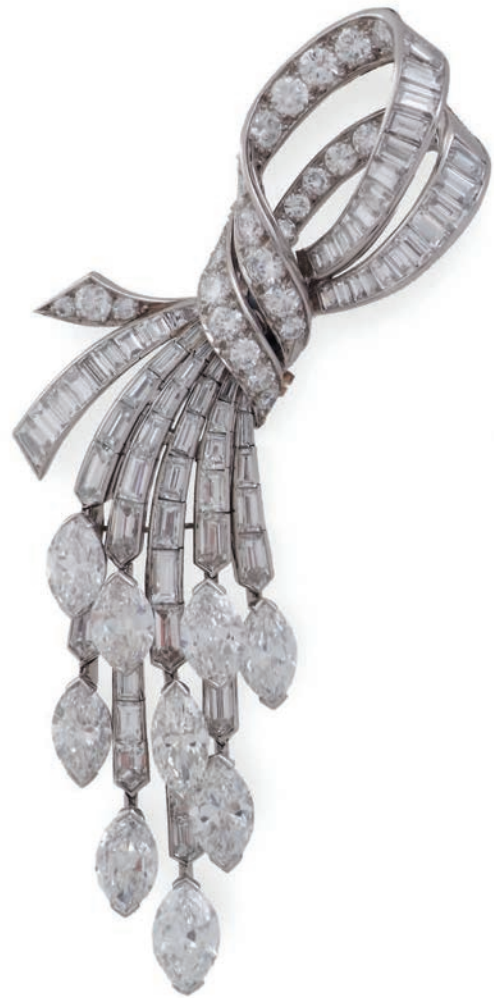
THIS PAGE 10. Baguette and brilliant-cut diamond tassel clip brooch by Van Cleef & Arpels, mounted in platinum