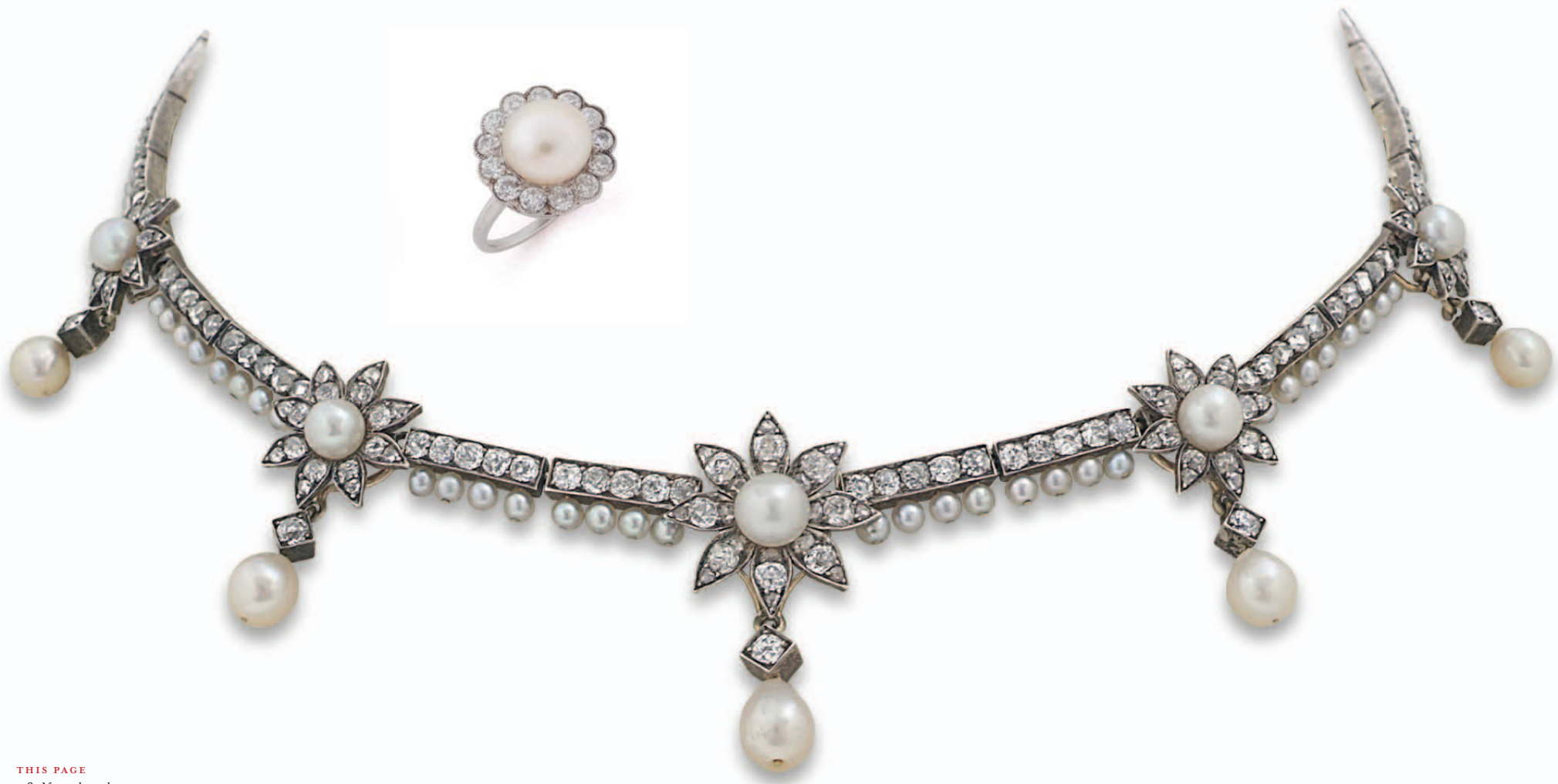
THIS PAGE 48. Natural pearl and diamond cluster ring