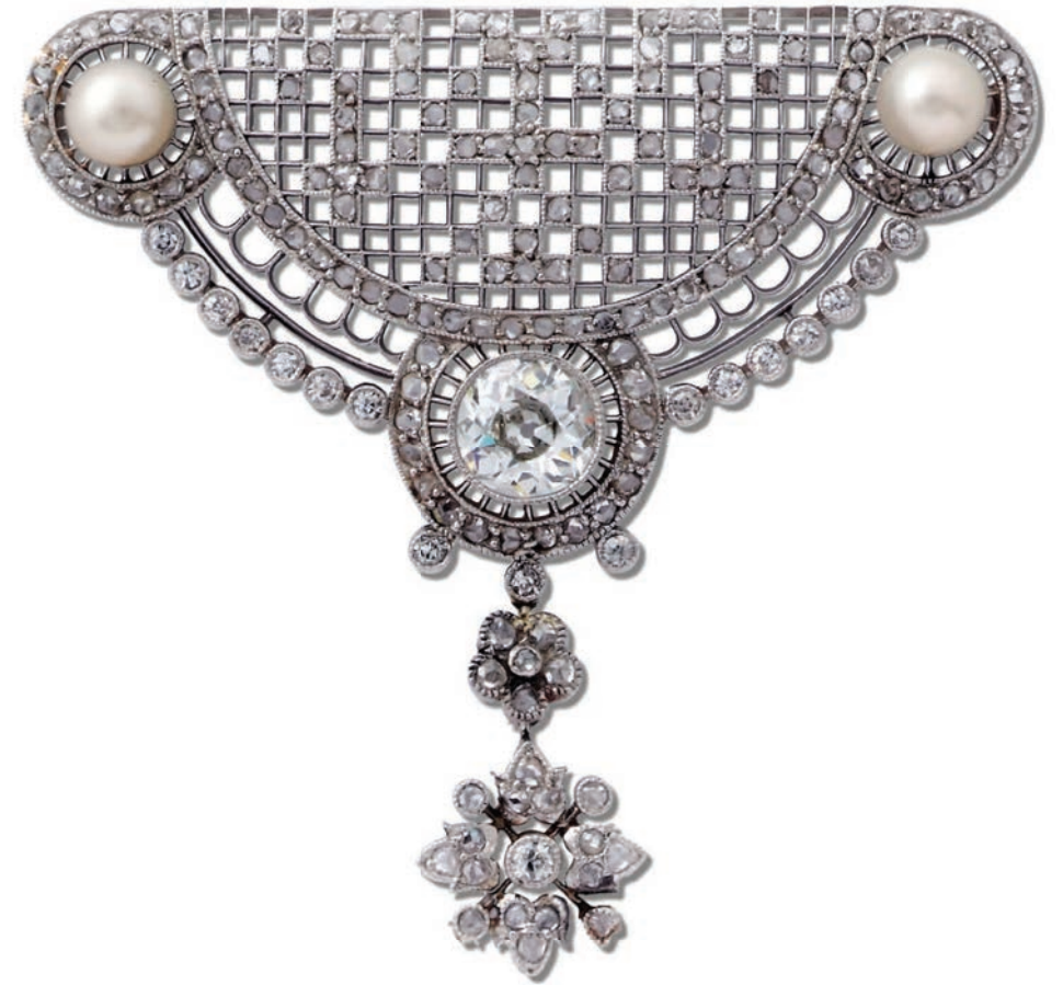
THIS PAGE 33. Belle Epoque diamond and pearl festoon brooch