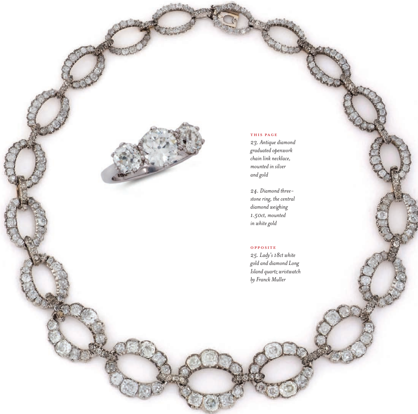
THIS PAGE 23. Antique diamond graduated openwork chain link necklace, mounted in silver and gold