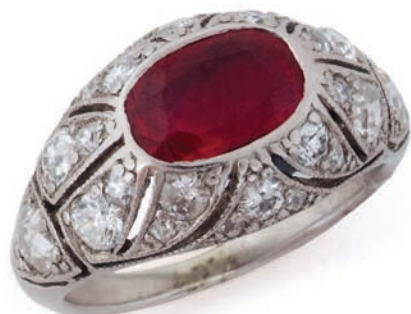
OPPOSITE LEFT 40. Burma ruby and diamond bombé cocktail ring