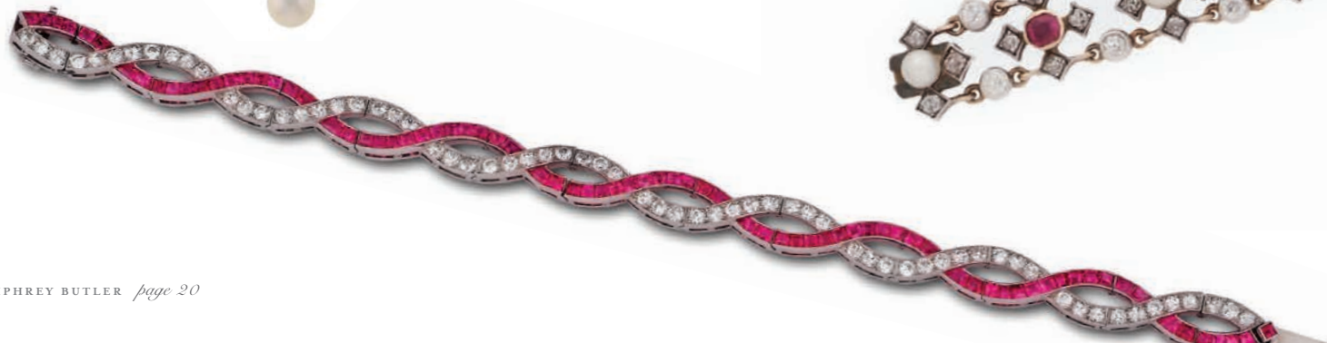
BELOW 28. Art Deco ruby and diamond entwined ribbon bracelet, mounted in platinum