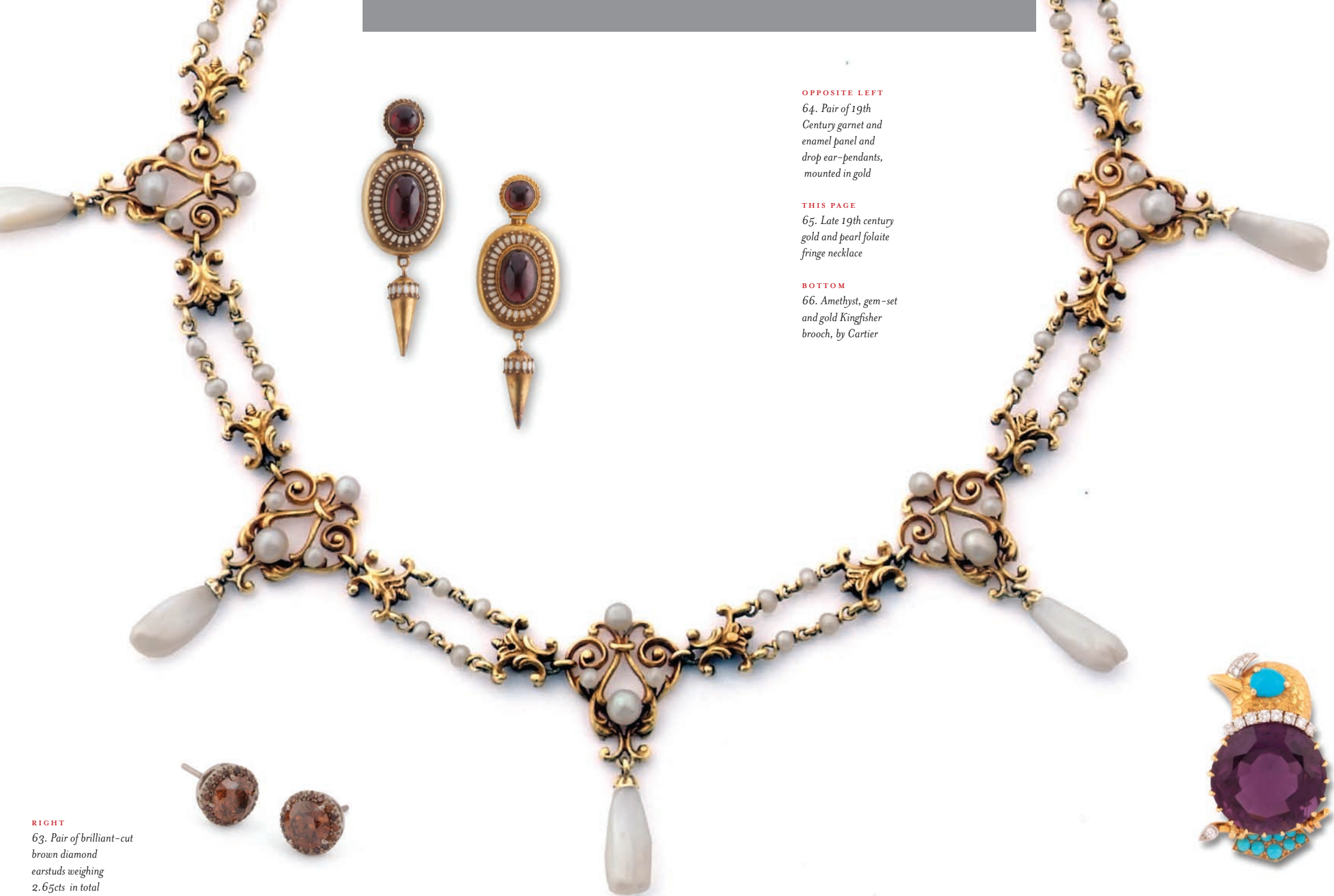
OPPOSITE LEFT 64. Pair of 19th Century garnet and enamel panel and drop ear-pendants, mounted in gold