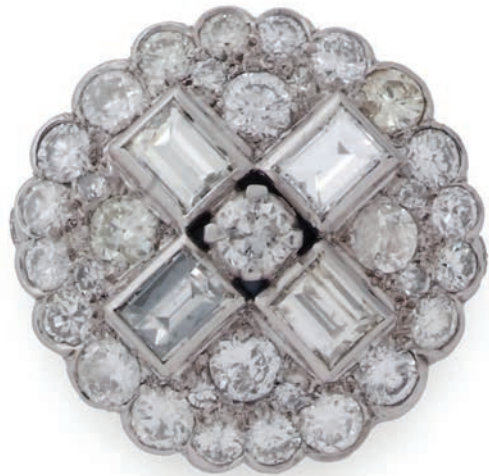
THIS PAGE 32. Diamond circular panel ring applied with a baguette-cut diamond cruciform motif, mounted in platinum