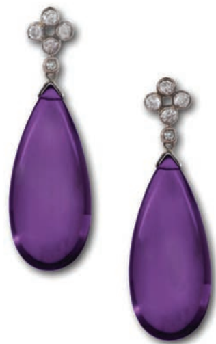
RIGHT 68. Pair of amethyst and diamond drop earrings with quatrefoil cluster tops