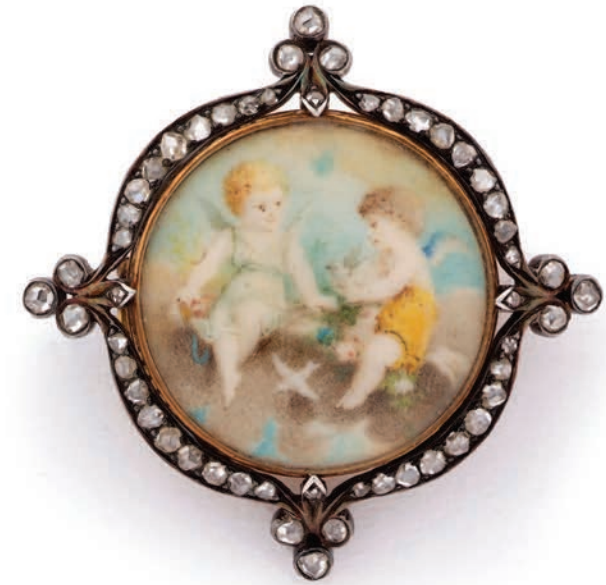
RIGHT 62. Antique diamond and gold miniature brooch, mounted in all gold