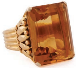
ABOVE 73. Rectangular-cut citrine cocktail ring with gold leaf and beadwork gallery