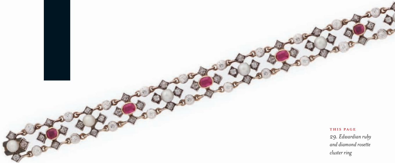
30. Antique pearl, ruby and diamond bracelet, mounted in silver and gold