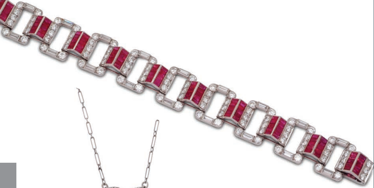
ABOVE 26. Art Deco ruby and diamond rooflink bracelet, by Cartier