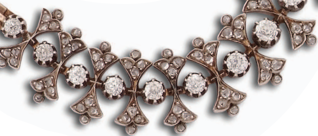
61. Antique diamond collet and trefoil bracelet forming a necklace, by Fontana Frères