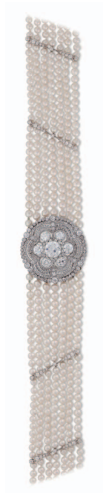
THIS PAGE 42. Belle Epoque pearl and diamond seven-strand choker with diamond pierced hexafoil cluster centrepiece