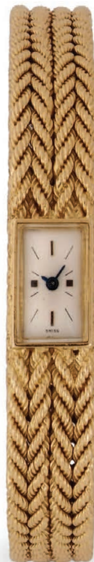
THIS PAGE 72. Lady's gold herring bone cocktail watch, by Vacheron Constantin for Hermes