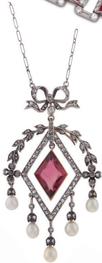
LEFT 27. Edwardian pink tourmaline, diamond and pearl tassel pendant of lozenge design