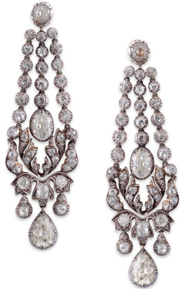
THIS PAGE 43. Pair of Victorian diamond chandelier ear-pendants of leaf and collet design, mounted in silver and gold