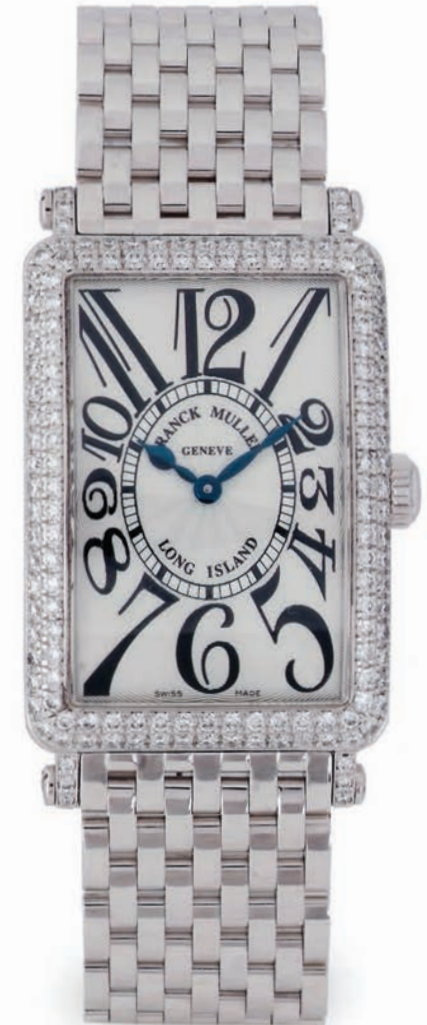
OPPOSITE 25. Lady's 18ct white gold and diamond Long Island quartz wristwatch by Franck Muller