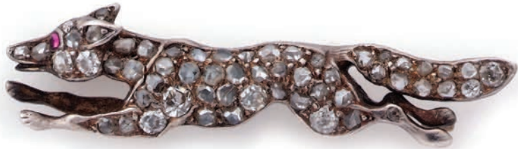
THIS PAGE 60. Antique diamond running fox brooch, mounted in silver and gold