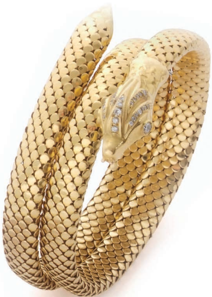
OPPOSITE 71. Gold and diamond sprung snake bangle