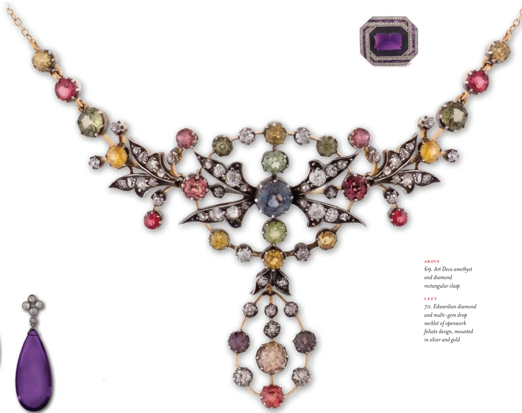
ABOVE 69. Art Deco amethyst and diamond rectangular clasp