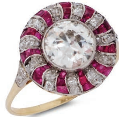
THIS PAGE 29. Edwardian ruby and diamond rosette cluster ring