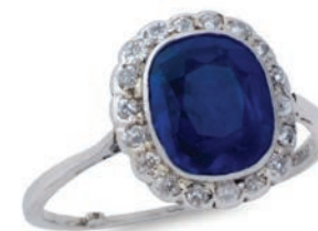
22. Cushion-shaped sapphire single-stone ring of 19.65cts with trilliant-cut diamond shoulders