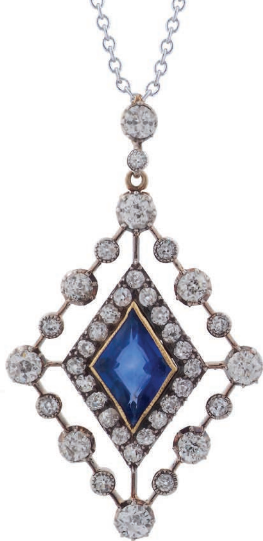
THIS PAGE 19. Edwardian diamond and sapphire pendant of openwork lozenge design, mounted in silver and gold