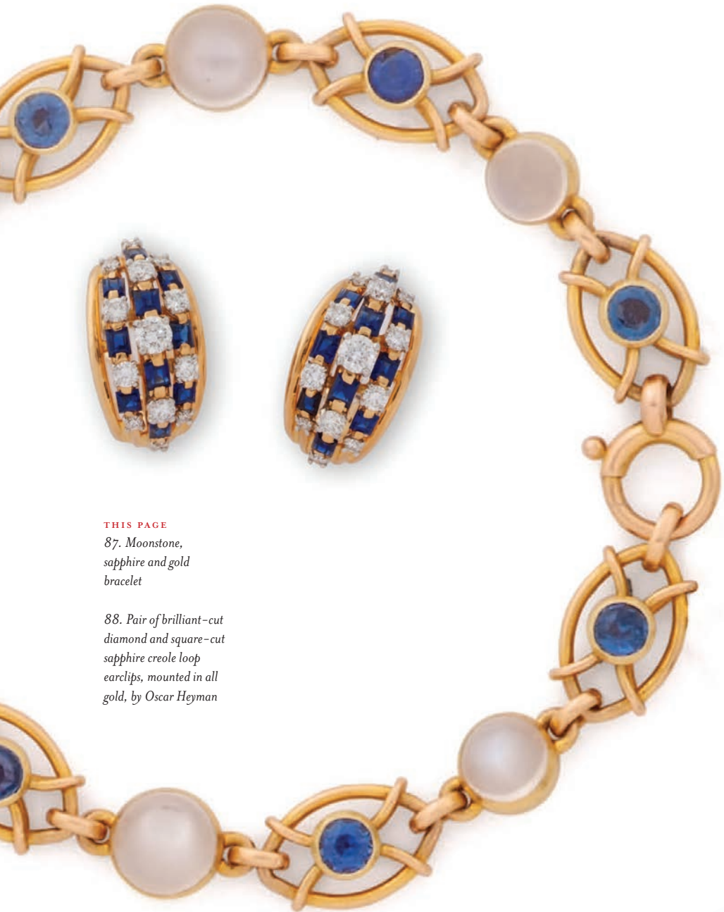
THIS PAGE 87. Moonstone, sapphire and gold bracelet