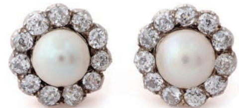
THIS PAGE 50. Pair of natural pearl and diamond circular cluster earstuds