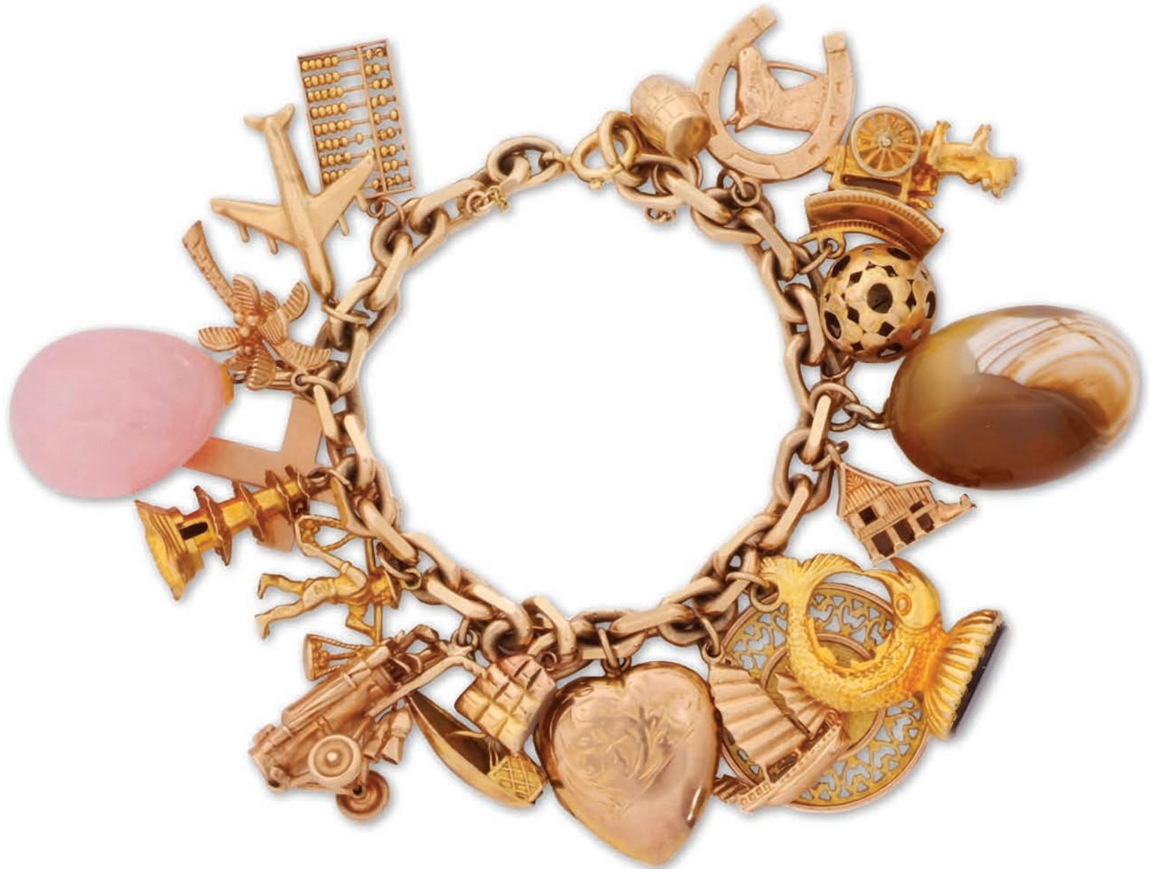
THIS PAGE 74. Gold open chain link bracelet suspending nineteen various gold and hardstone charms