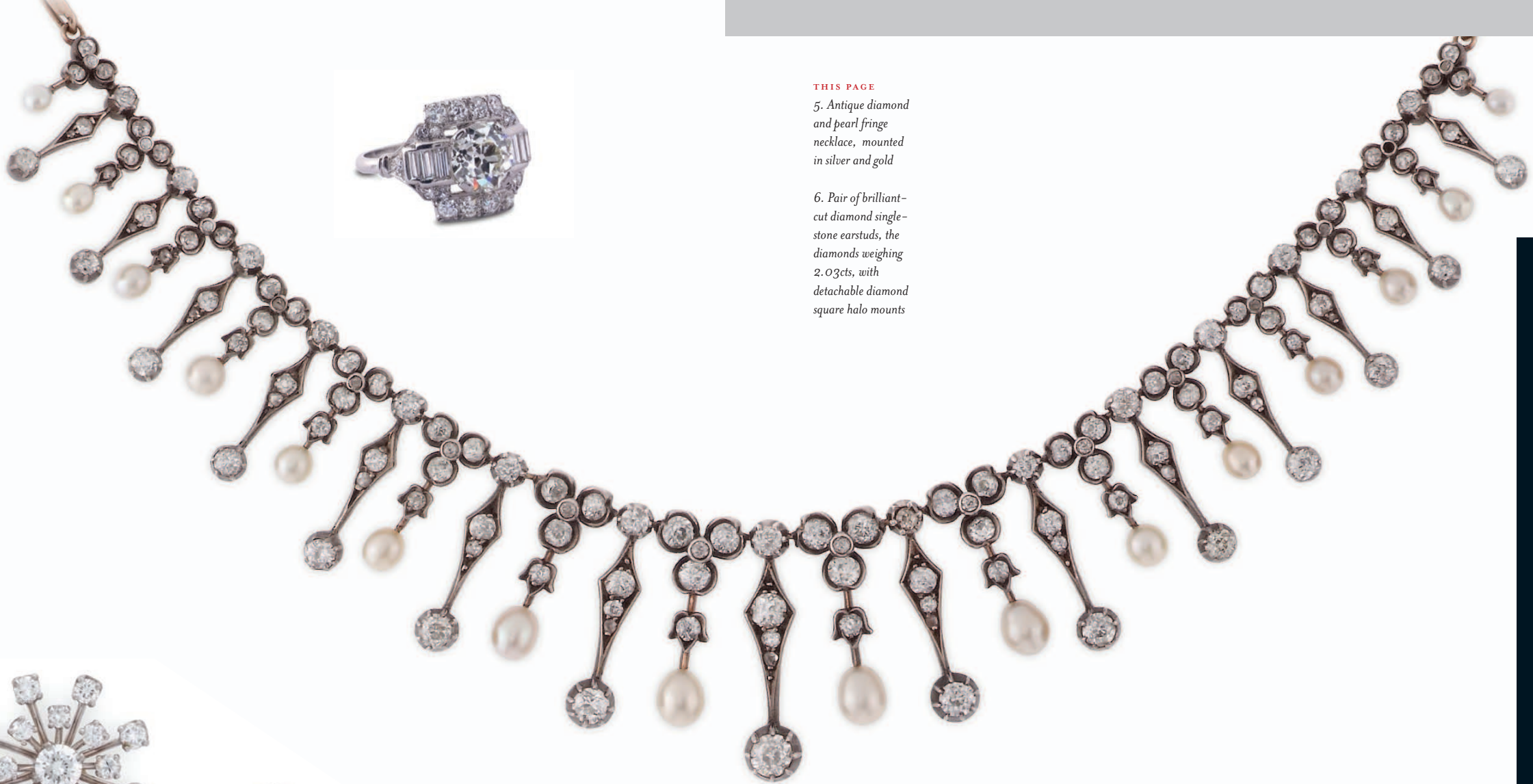
THIS PAGE 5. Antique diamond and pearl fringe necklace, mounted in silver and gold