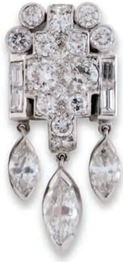
OPPOSITE 31. Pair of diamond panel ear-pendants with navette-cut diamond flexible drops