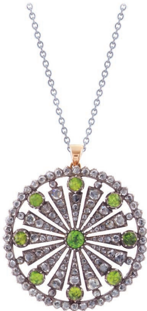
36. Antique demantoid garnet and rose-cut diamond wagon wheel brooch pendant, mounted in gold