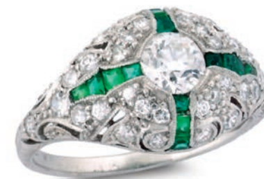
THIS PAGE 52. Art Deco diamond and emerald bombe cluster ring, mounted in platinum