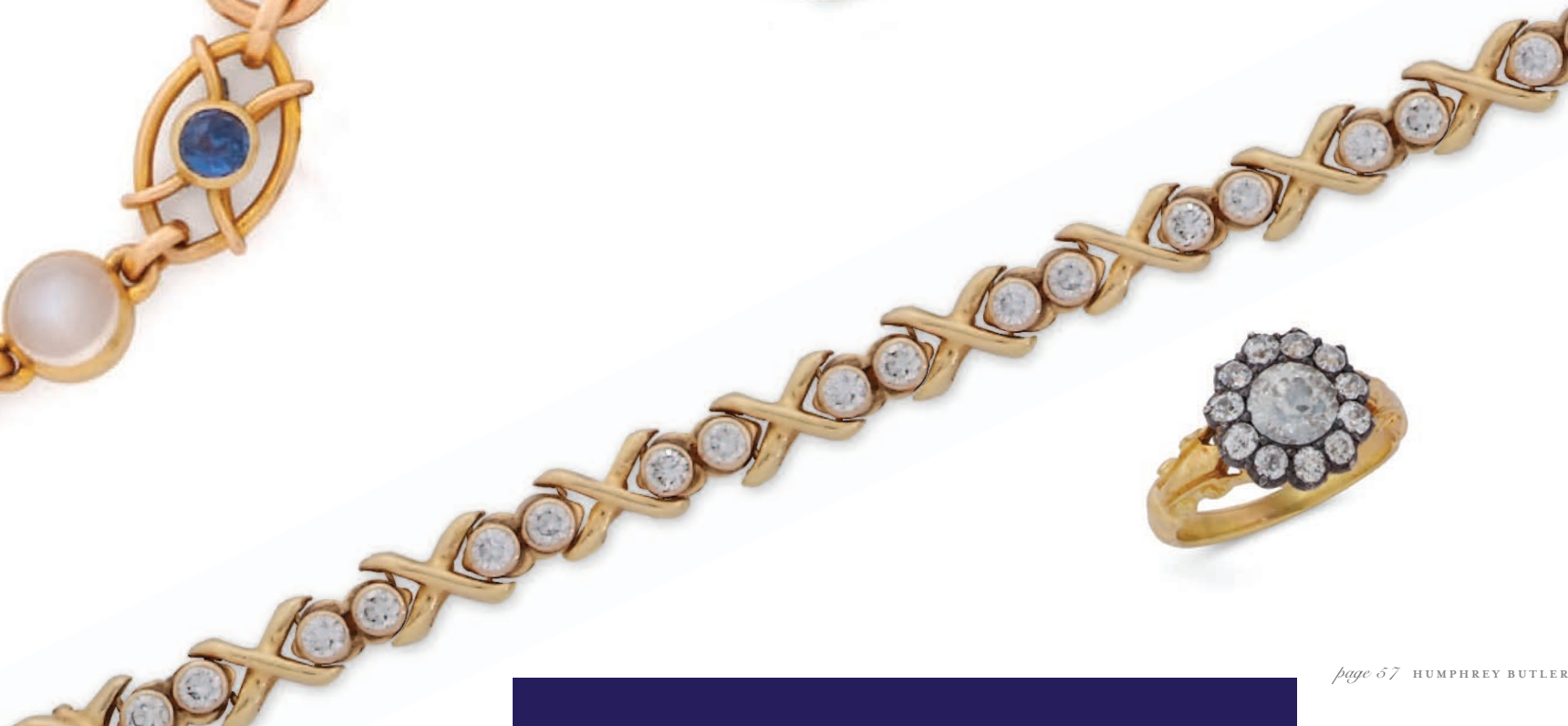
91. Antique diamond circular cluster ring, mounted in gold