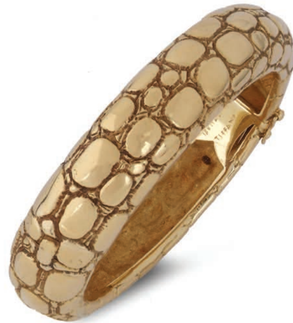
THIS PAGE 89. 18ct gold hinged bangle of snakeskin design, by Tiffany