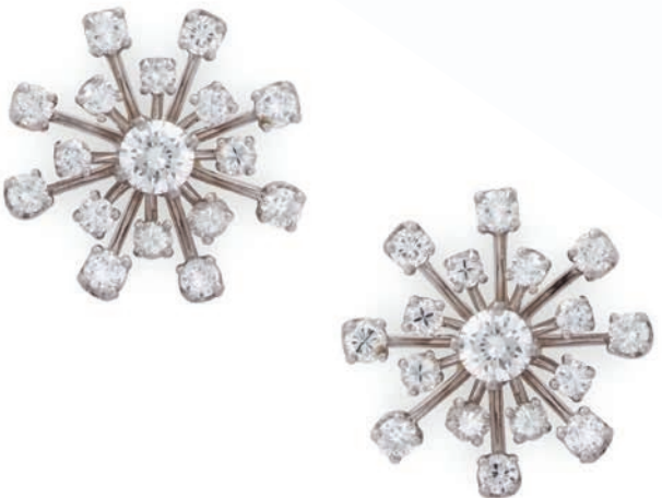
LEFT 4. Pair of brilliant-cut diamond snowflake cluster earclips