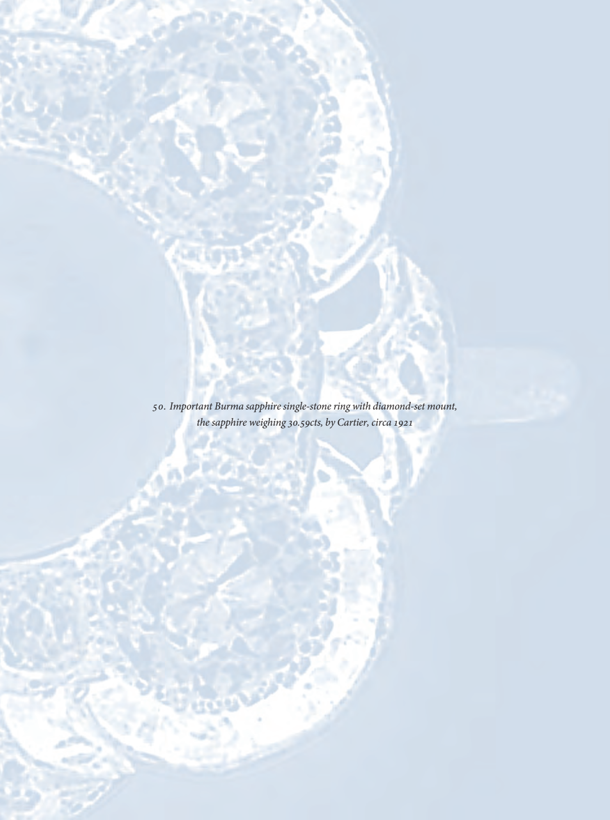
50. Important Burma sapphire single-stone ring with diamond-set mount, the sapphire weighing 30.59cts, by Cartier, circa 1921