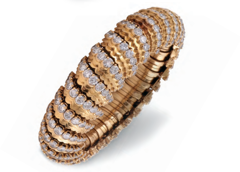
21. Antique polychrome enamel and gold bangle set with a single pink topaz, Russian 22. Gold and diamond fish-scale bracelet by Van Cleef & Arpels