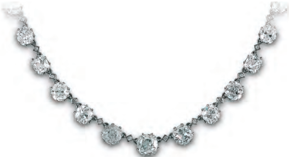
27. Victorian graduated diamond collet necklace mounted in silver and gold