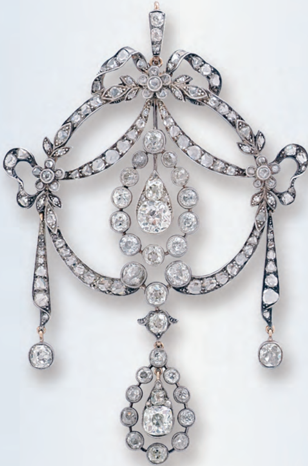
26. Belle Époque diamond and rose-cut diamond openwork pendant in the garland style, mounted in silver and gold