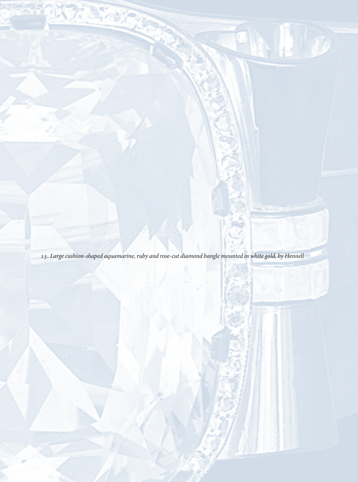
15. Large cushion-shaped aquamarine, ruby and rose-cut diamond bangle mounted in white gold, by Hennell