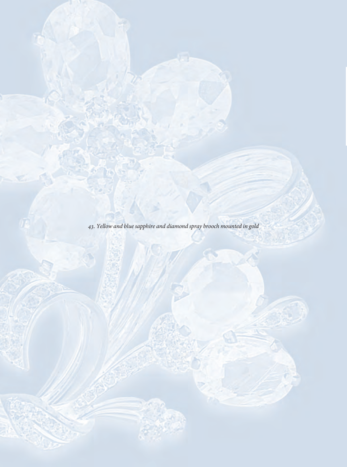
43. Yellow and blue sapphire and diamond spray brooch mounted in gold