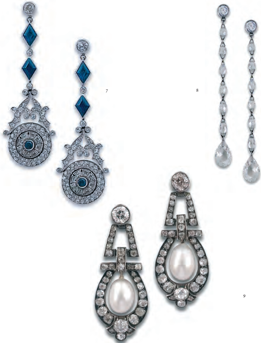
7. Pair of Belle Époque diamond and sapphire ear-pendants of stylised wheel design by Van Cleef & Arpels