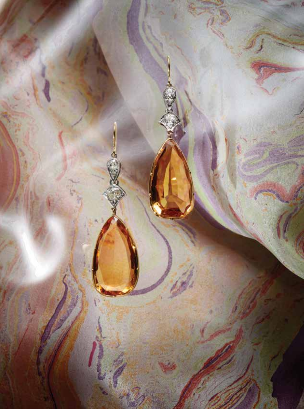
OPPOSITE PAGE 53. Pair of pear-shaped topaz and diamond ear-pendants, the topaz weighing 17.95cts and 15.15cts