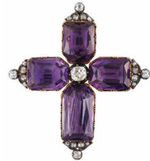
THIS PAGE 54. Edwardian faceted amethyst, pearl and rose-cut diamond heart pendant 55. 1940s orange sapphire and old mine-cut diamond cocktail ring, mounted in gold and platinum 56. Antique faceted amethyst and diamond pendant cross, mounted in silver and gold